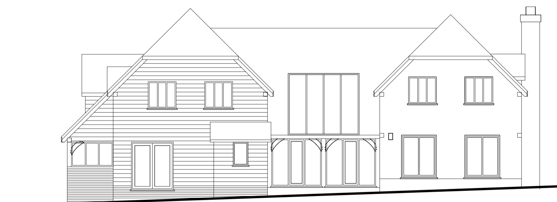
Rear Elevation ( South East )