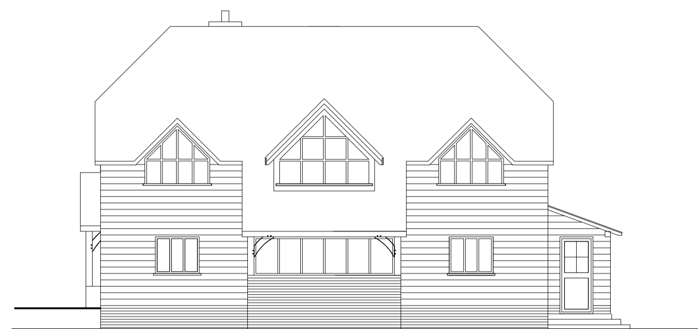
Side Elevation ( South West )

This drawing must be read in association with the full Building Regulation Specification