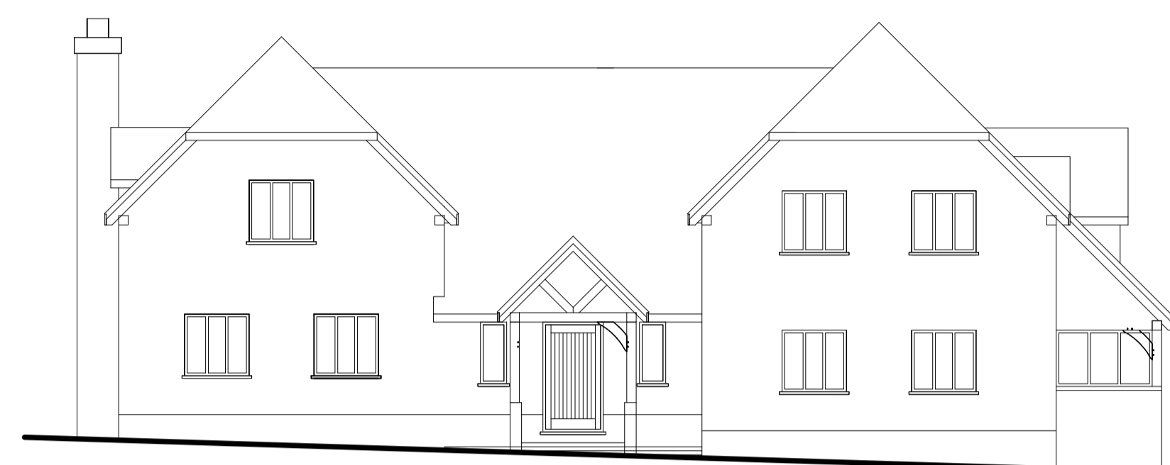
Front Elevation ( North West )