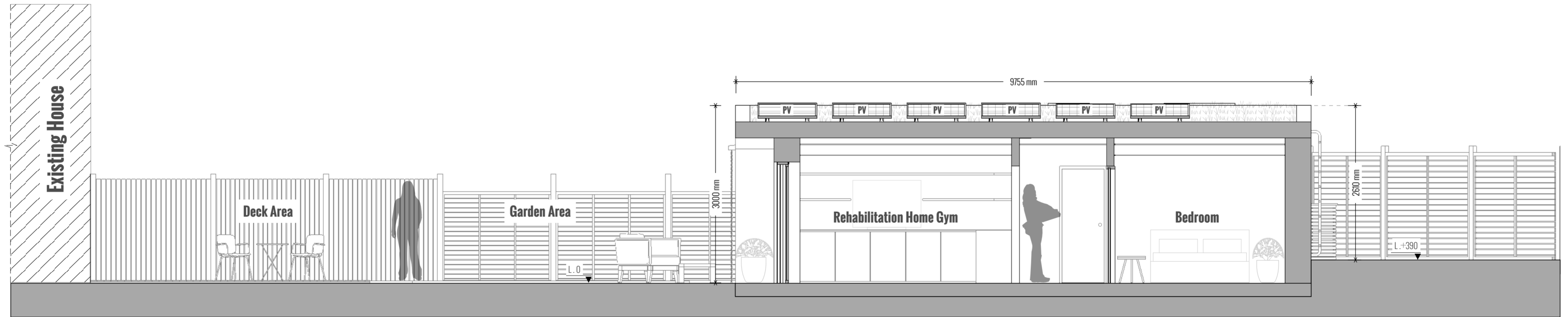
02 PROPOSED SECTION BB scale 1:50

Disclaimer Do not scale from this drawing. Check all dimensions on site before fabrication or setting out. This document is copyright and may not be reproduced without permission of the owner.