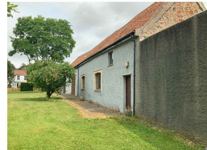
View Showing East Elevation and Partial South Elevation

Note: East and south elevations remain unchanged