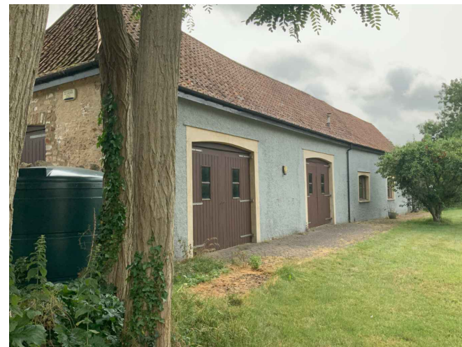
View Showing East Elevation and Partial North Elevation