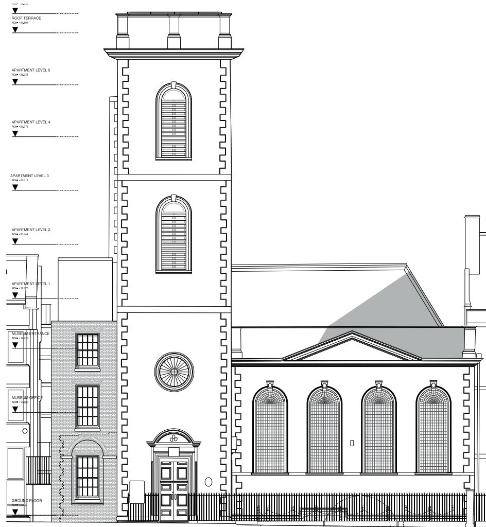
Front Elevation 1:200@A3 0 1 2 3 4 5 6 M