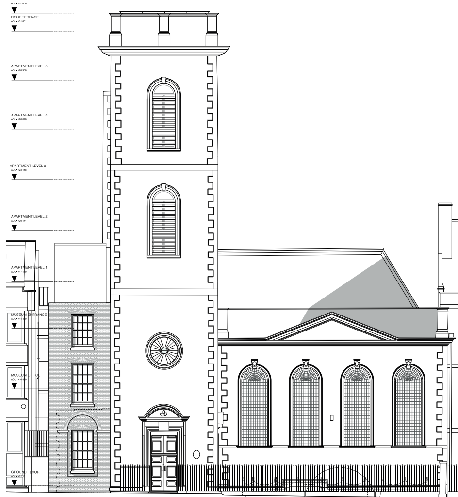
Front Elevation 1:200@A3 0 1 2 3 4 5 6 M