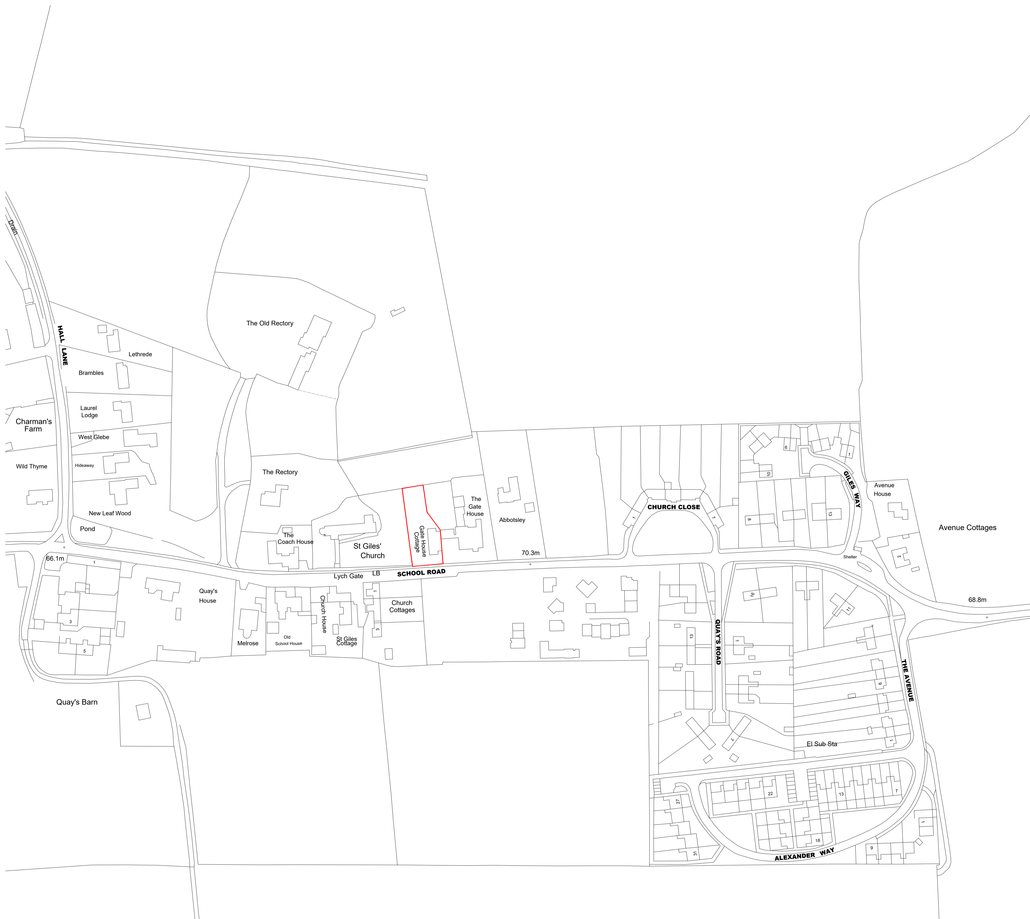
Location Plan 1:1250 scale 0m 25m 1:1250 Scale Bar