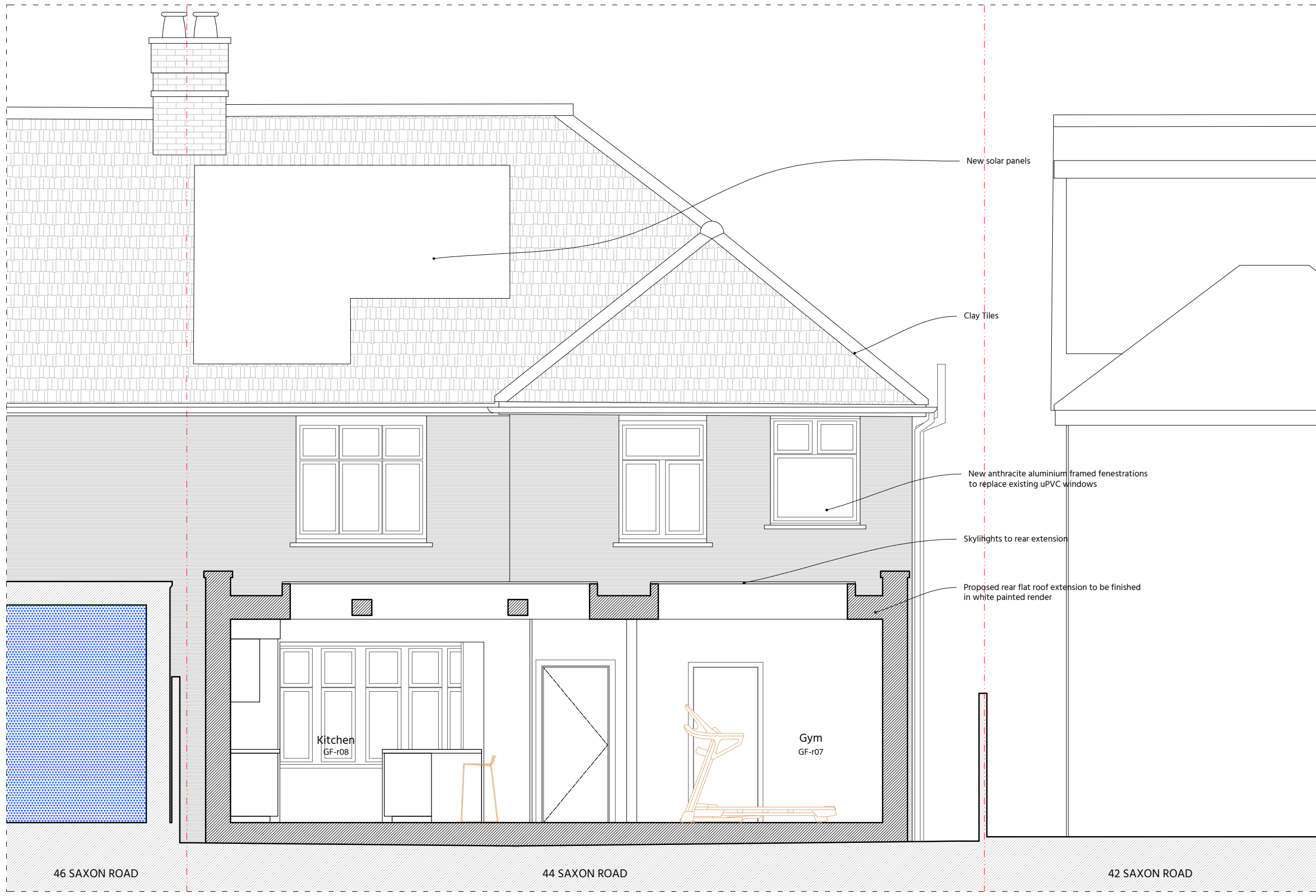
01 Section B-B - Proposed Scale 1:50

DO NOT SCALE FROM THIS DRAWING. LEVELS AND DIMENSIONS TO BE CHECKED ON SITE BY THE CONTRACTOR AND ANY DISCREPANCIES TO BE NOTIFIED TO THE ARCHITECT IMMEDIATELY. DRAWING TO BE READ ALONGSIDE WITH ALL RELEVANT CONSULTANT'S DRAWINGS AND SPECIFICATIONS. COPYRIGHT OF THIS DRAWING TO BE RETAINED BY THE ARCHITECT.