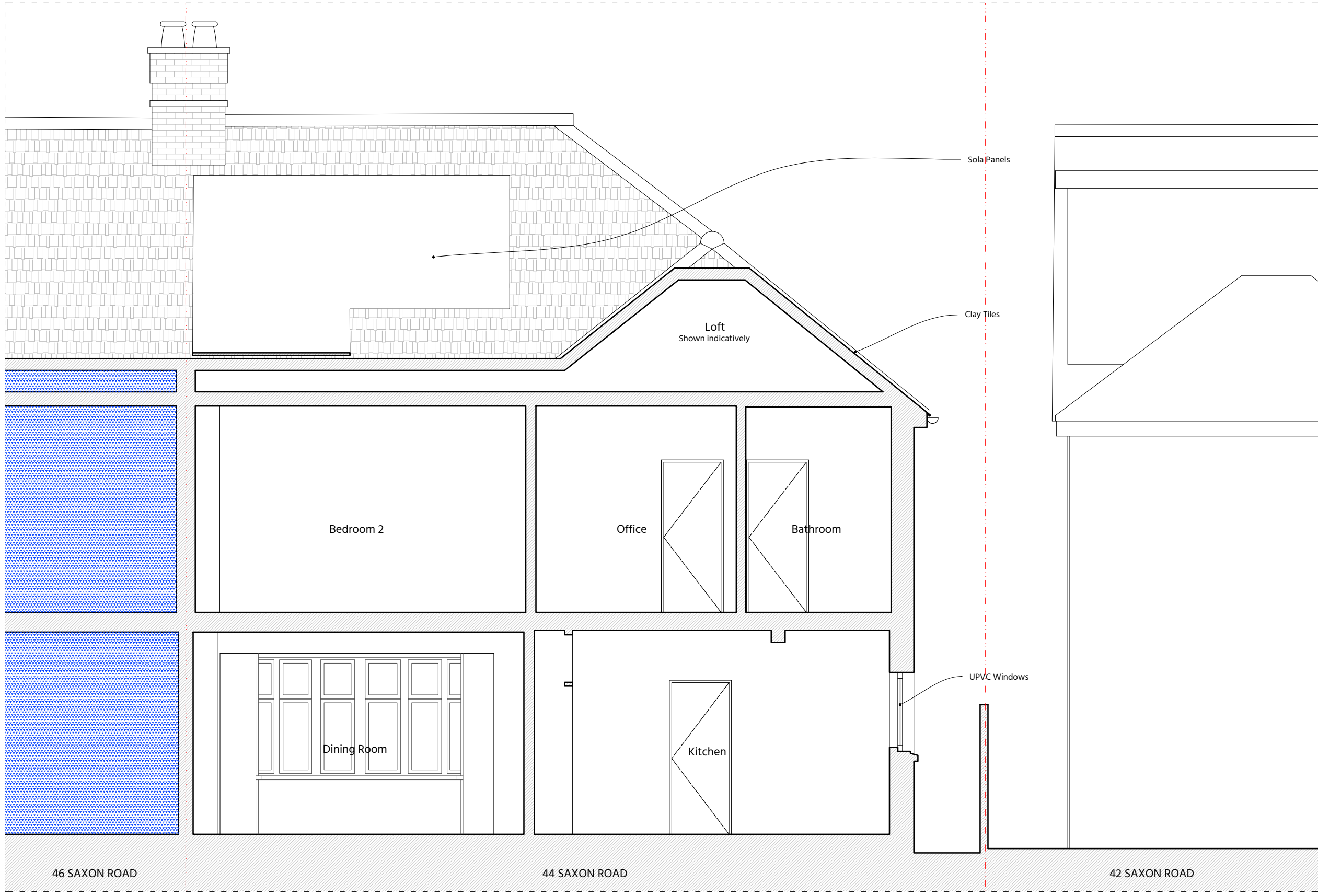
01 Section B-B - Existing

DO NOT SCALE FROM THIS DRAWING. LEVELS AND DIMENSIONS TO BE CHECKED ON SITE BY THE CONTRACTOR AND ANY DISCREPANCIES TO BE NOTIFIED TO THE ARCHITECT IMMEDIATELY. DRAWING TO BE READ ALONGSIDE WITH ALL RELEVANT CONSULTANT'S DRAWINGS AND SPECIFICATIONS. COPYRIGHT OF THIS DRAWING TO BE RETAINED BY THE ARCHITECT.