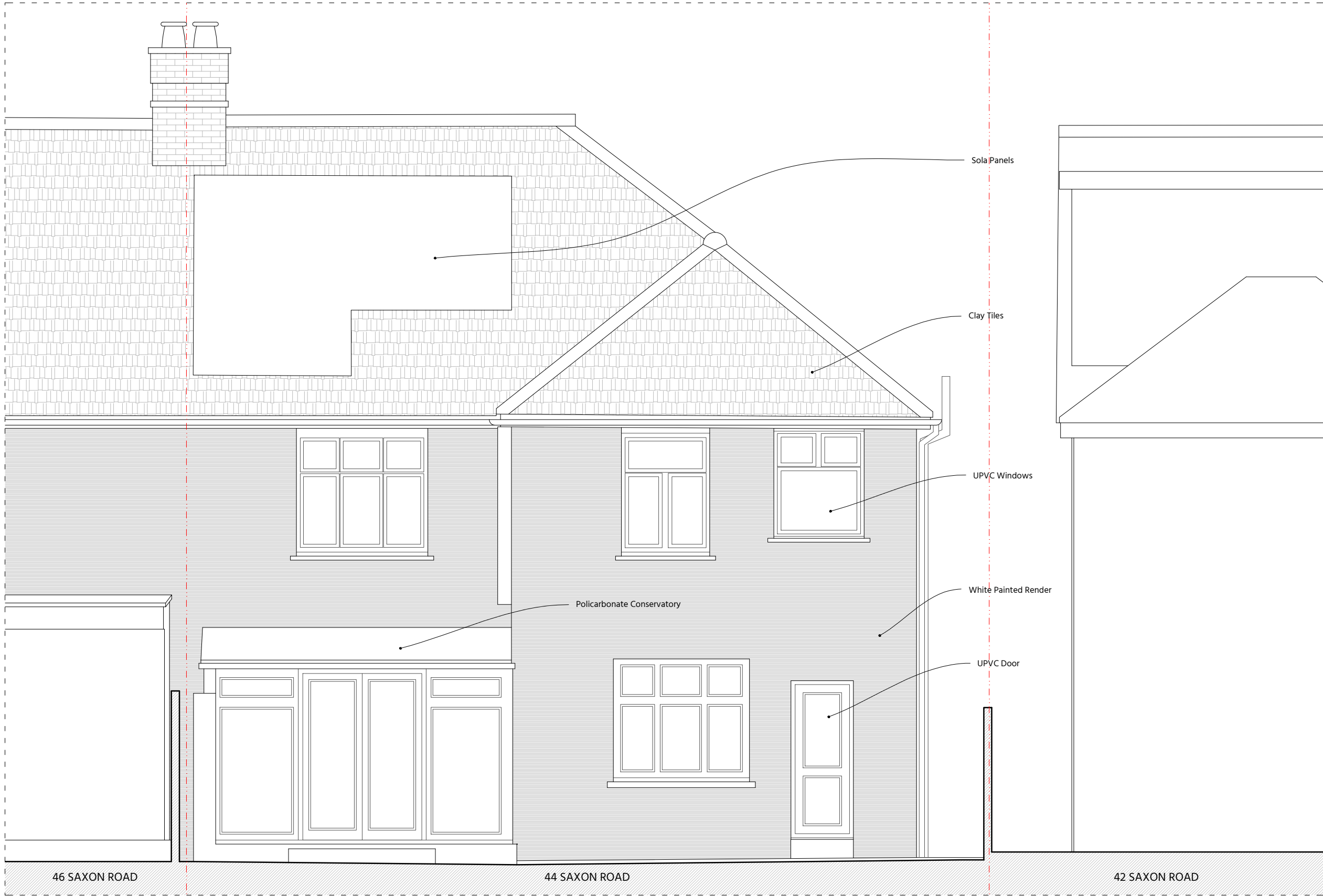
01 Rear Elevation - Existing

DO NOT SCALE FROM THIS DRAWING. LEVELS AND DIMENSIONS TO BE CHECKED ON SITE BY THE CONTRACTOR AND ANY DISCREPANCIES TO BE NOTIFIED TO THE ARCHITECT IMMEDIATELY. DRAWING TO BE READ ALONGSIDE WITH ALL RELEVANT CONSULTANT'S DRAWINGS AND SPECIFICATIONS. COPYRIGHT OF THIS DRAWING TO BE RETAINED BY THE ARCHITECT.