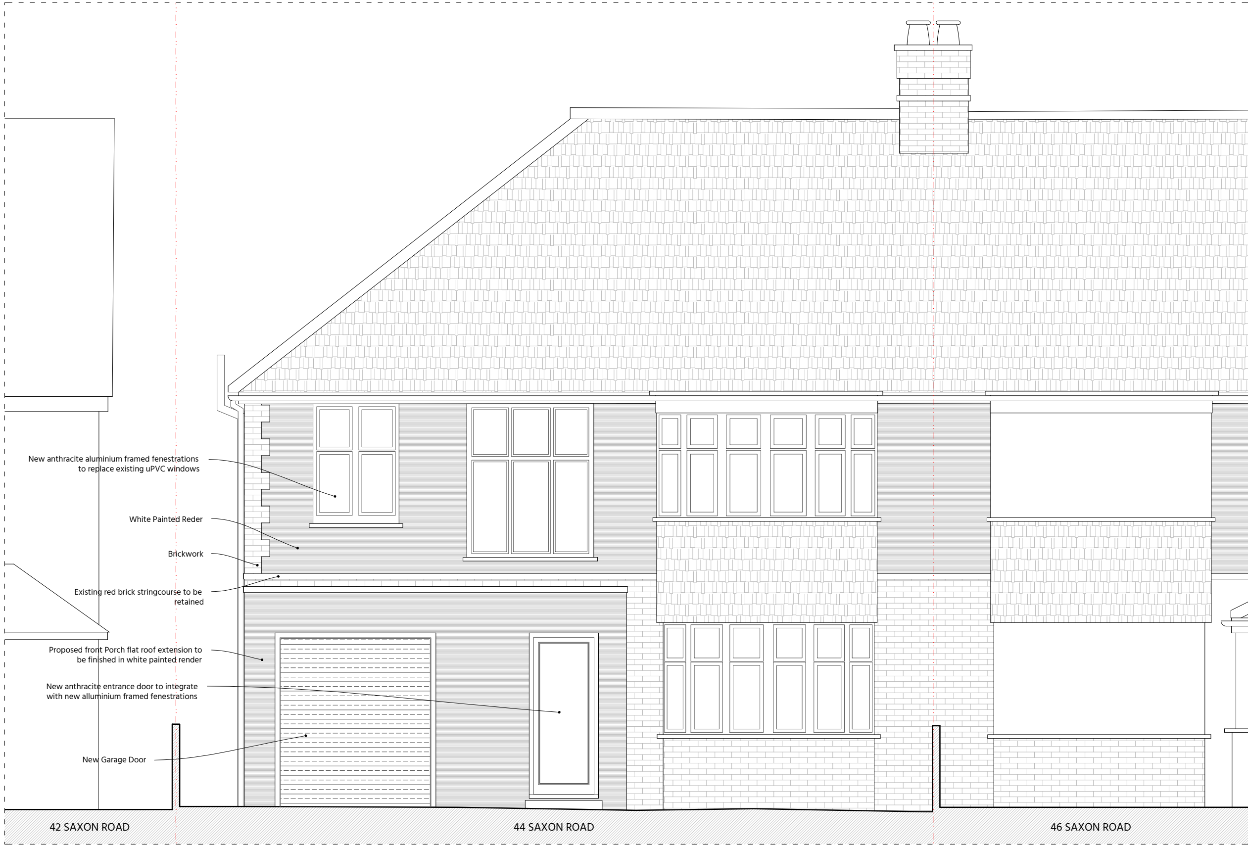
01 Front Elevation - Proposed

DO NOT SCALE FROM THIS DRAWING. LEVELS AND DIMENSIONS TO BE CHECKED ON SITE BY THE CONTRACTOR AND ANY DISCREPANCIES TO BE NOTIFIED TO THE ARCHITECT IMMEDIATELY. DRAWING TO BE READ ALONGSIDE WITH ALL RELEVANT CONSULTANT'S DRAWINGS AND SPECIFICATIONS. COPYRIGHT OF THIS DRAWING TO BE RETAINED BY THE ARCHITECT.