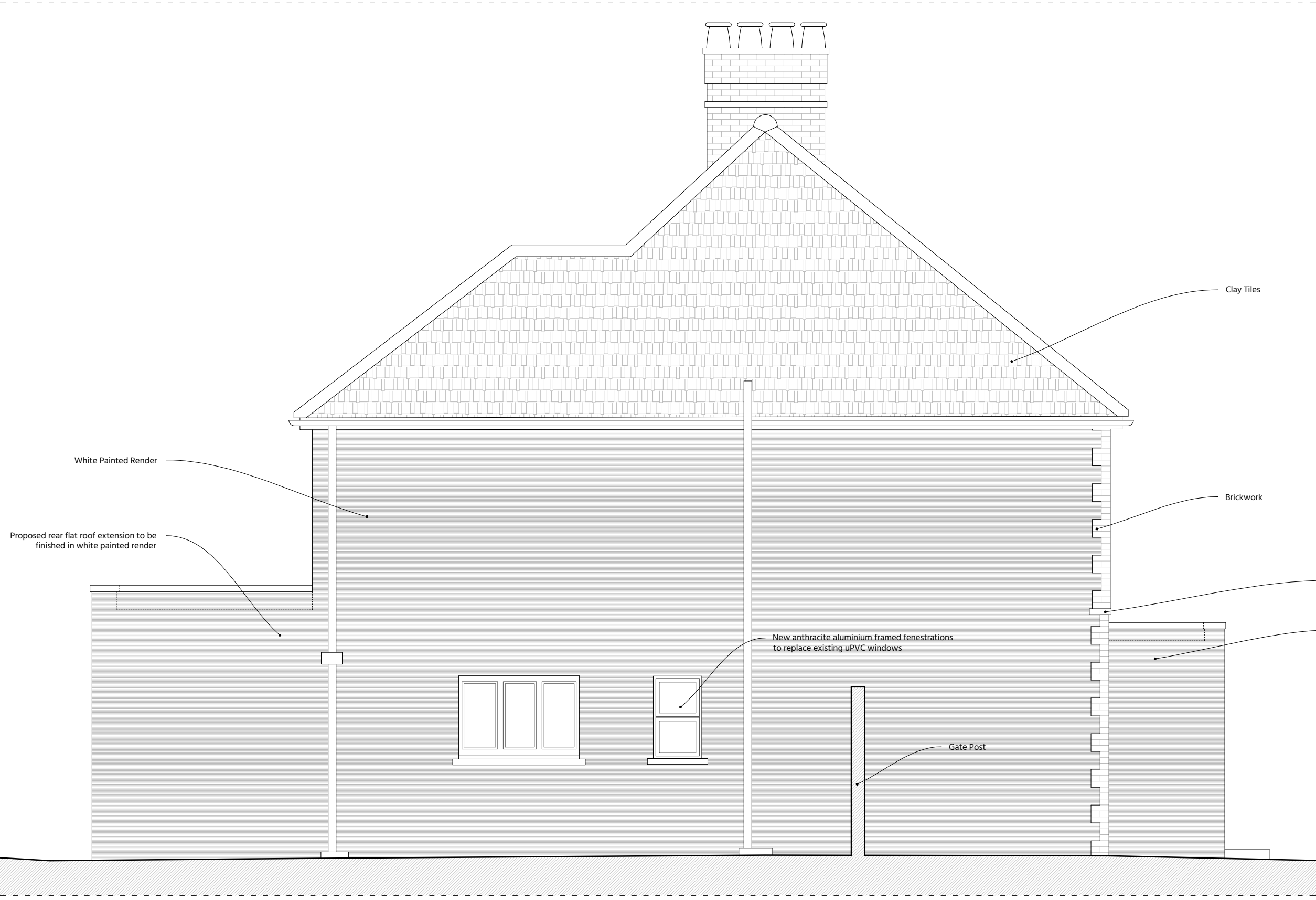
01 Side Elevation - Proposed Scale 1:50

DO NOT SCALE FROM THIS DRAWING. LEVELS AND DIMENSIONS TO BE CHECKED ON SITE BY THE CONTRACTOR AND ANY DISCREPANCIES TO BE NOTIFIED TO THE ARCHITECT IMMEDIATELY. DRAWING TO BE READ ALONGSIDE WITH ALL RELEVANT CONSULTANT'S DRAWINGS AND SPECIFICATIONS. COPYRIGHT OF THIS DRAWING TO BE RETAINED BY THE ARCHITECT.