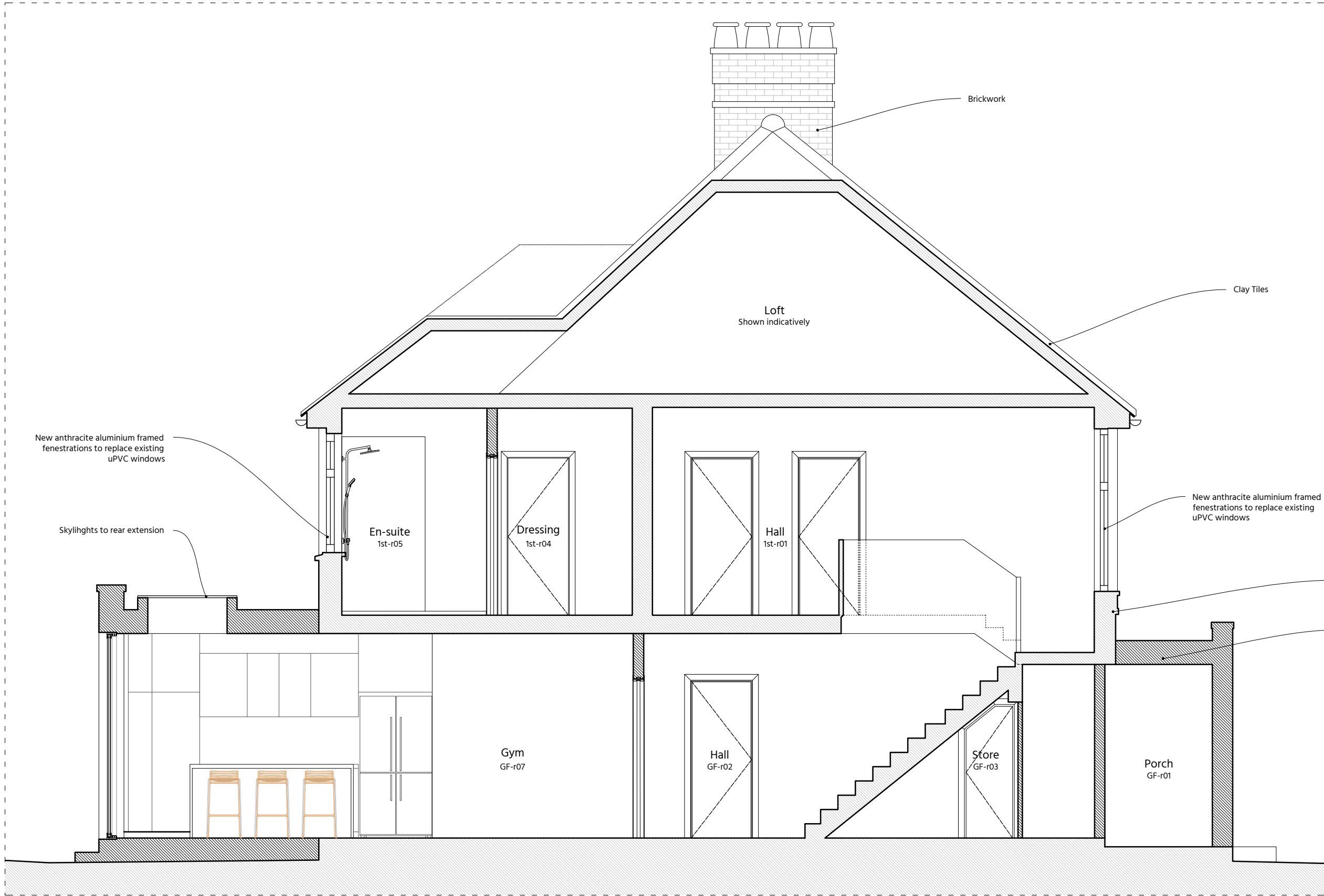
01 Section A-A - Proposed

DO NOT SCALE FROM THIS DRAWING. LEVELS AND DIMENSIONS TO BE CHECKED ON SITE BY THE CONTRACTOR AND ANY DISCREPANCIES TO BE NOTIFIED TO THE ARCHITECT IMMEDIATELY. DRAWING TO BE READ ALONGSIDE WITH ALL RELEVANT CONSULTANT'S DRAWINGS AND SPECIFICATIONS. COPYRIGHT OF THIS DRAWING TO BE RETAINED BY THE ARCHITECT.