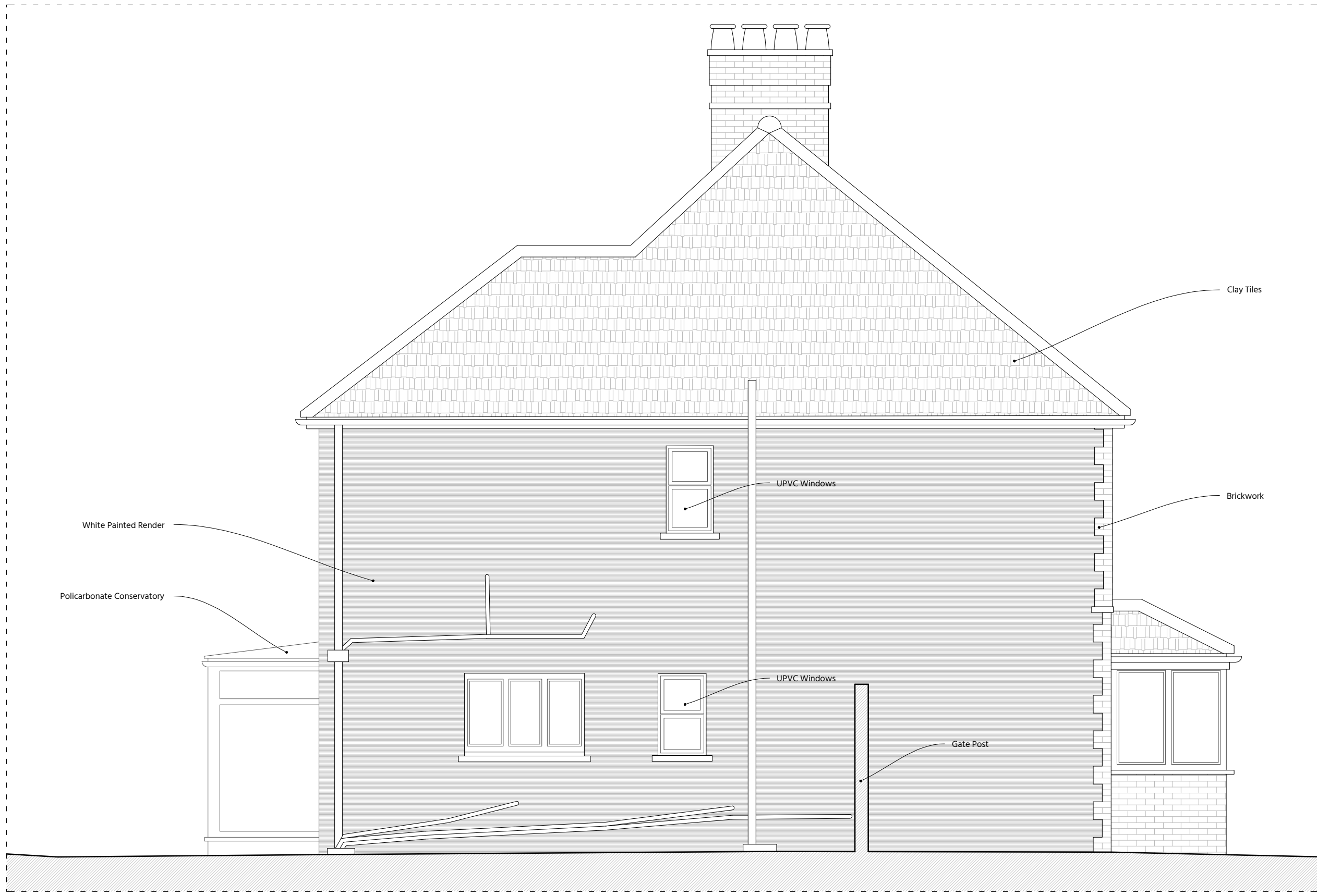
01 Side Elevation - Existing Scale 1:50

DO NOT SCALE FROM THIS DRAWING. LEVELS AND DIMENSIONS TO BE CHECKED ON SITE BY THE CONTRACTOR AND ANY DISCREPANCIES TO BE NOTIFIED TO THE ARCHITECT IMMEDIATELY. DRAWING TO BE READ ALONGSIDE WITH ALL RELEVANT CONSULTANT'S DRAWINGS AND SPECIFICATIONS. COPYRIGHT OF THIS DRAWING TO BE RETAINED BY THE ARCHITECT.