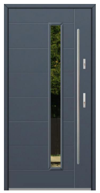
Aluminium/Stainless steel door