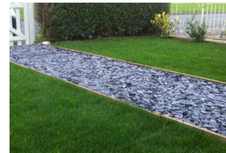
PERMEABLE PATH AND LAWN PRECEDENT