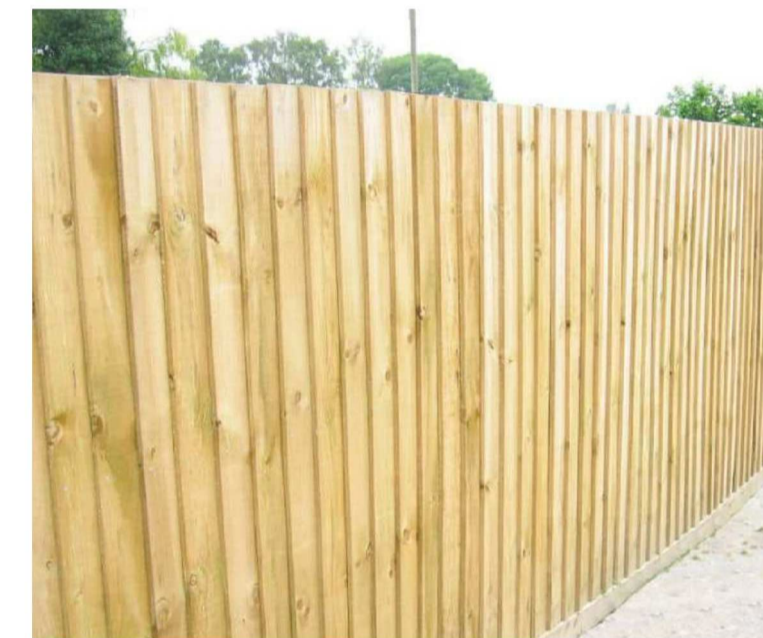
FEATHER EDGE TIMBER FENCE PRECEDENT. SUPPLIER SPECIFICATION: https://www.travisperkins.co.uk/feather-edge-boards/22mm-x-150mm-x-1-8m-green-treated-featheredge-fencing-board-2ex/p/937133