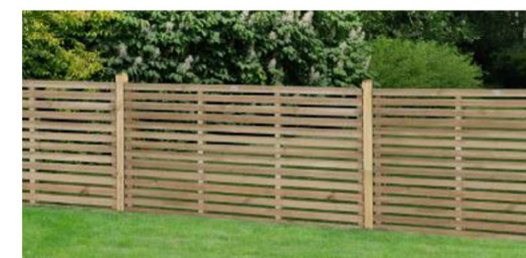
LOW LEVEL SLATTED TIMBER FENCE PRECEDENT