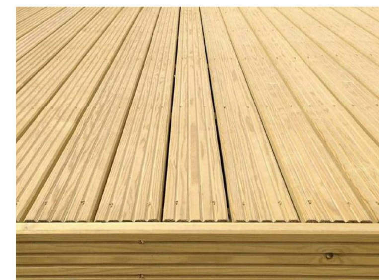
TIMBER DECKING PRECEDENT

NOTE: All measurements and spans to be checked on site and confirmed before fabrication and work commences. This drawing shows design intent only for all structural components. Structural Engineer to size/design all required structural components and provide calculations for Building Control approval before work commences. Structural Engineer and specialist designers to carry out own survey for Structural Component spans and sizes / specialist designs. All relevant statutory notices to be sent to local Authority by builder at various stages of the contract.