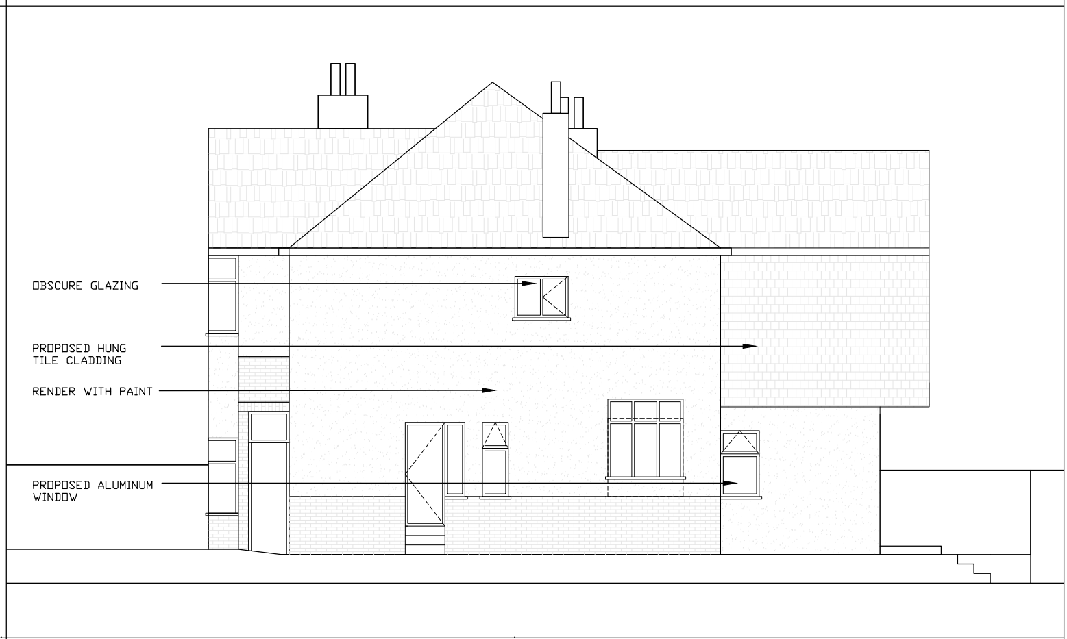
SOUTH WEST ELEVATION - PROPOSED