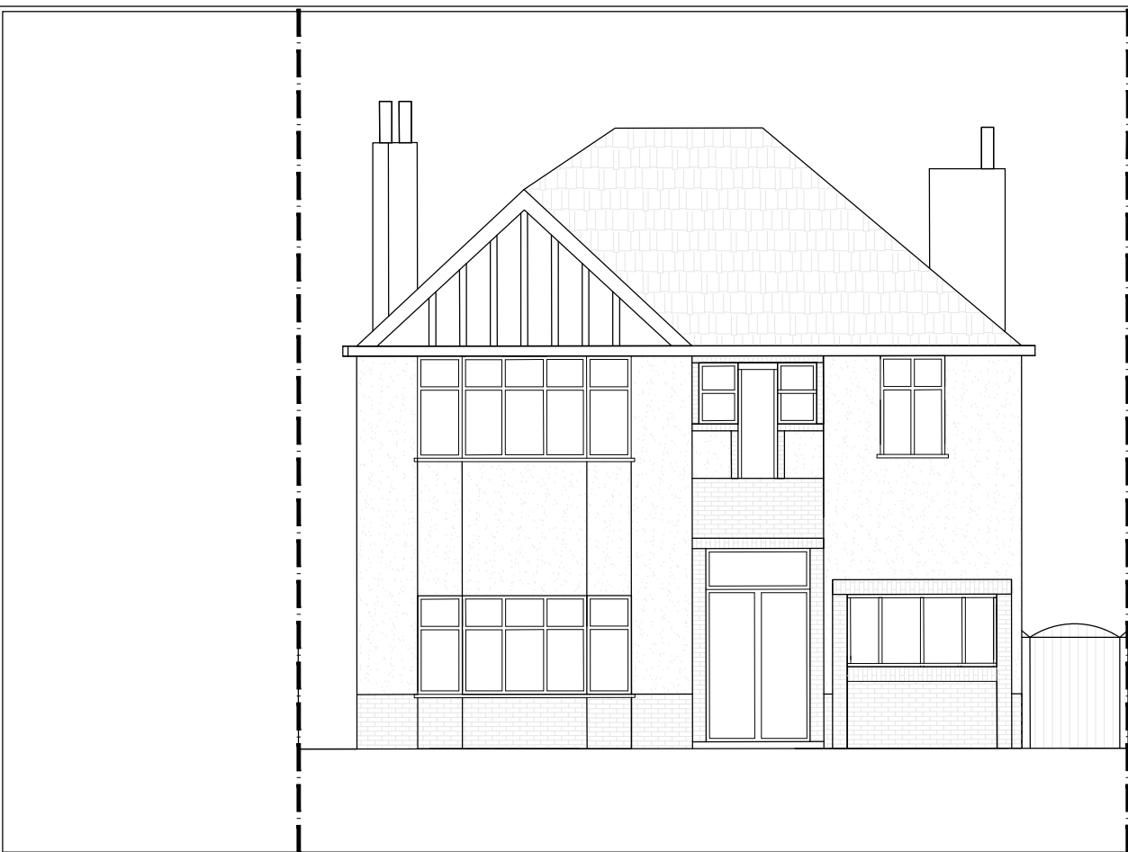
NORTH WEST ELEVATION - PROPOSED