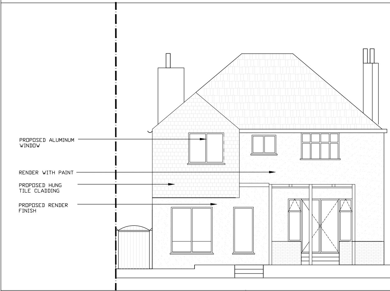
SOUTH EAST ELEVATION - PROPOSED