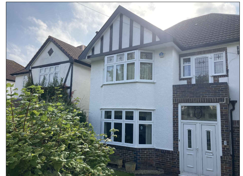
LOOKING TOWARDS NORTH WEST ELEVATION