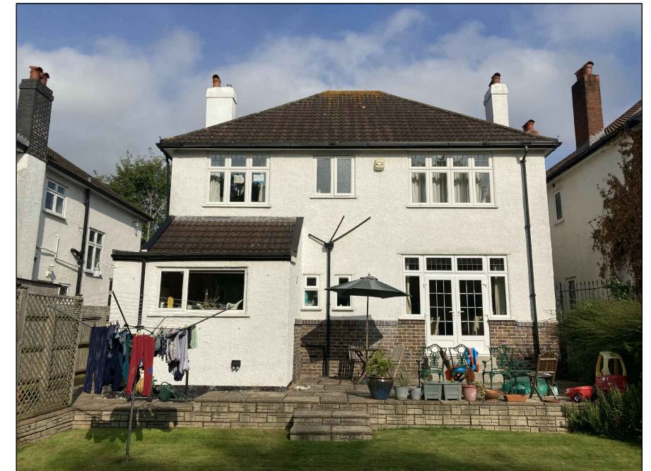
LOOKING TOWARDS SOUTH EAST ELEVATION