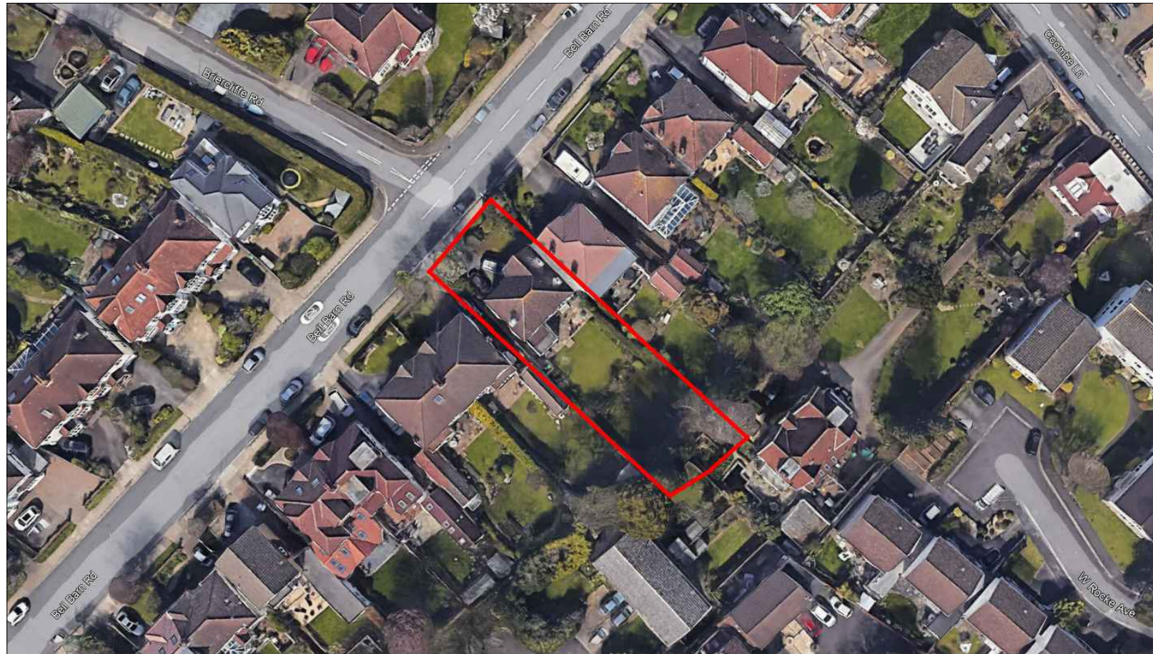
LOOKING NORTH EAST OVER SITE