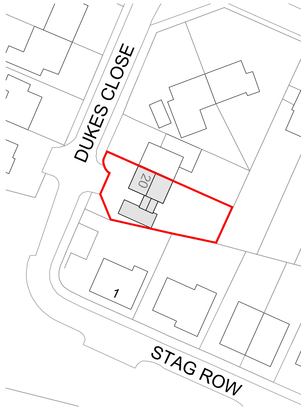
Proposed Block Plan 1:500