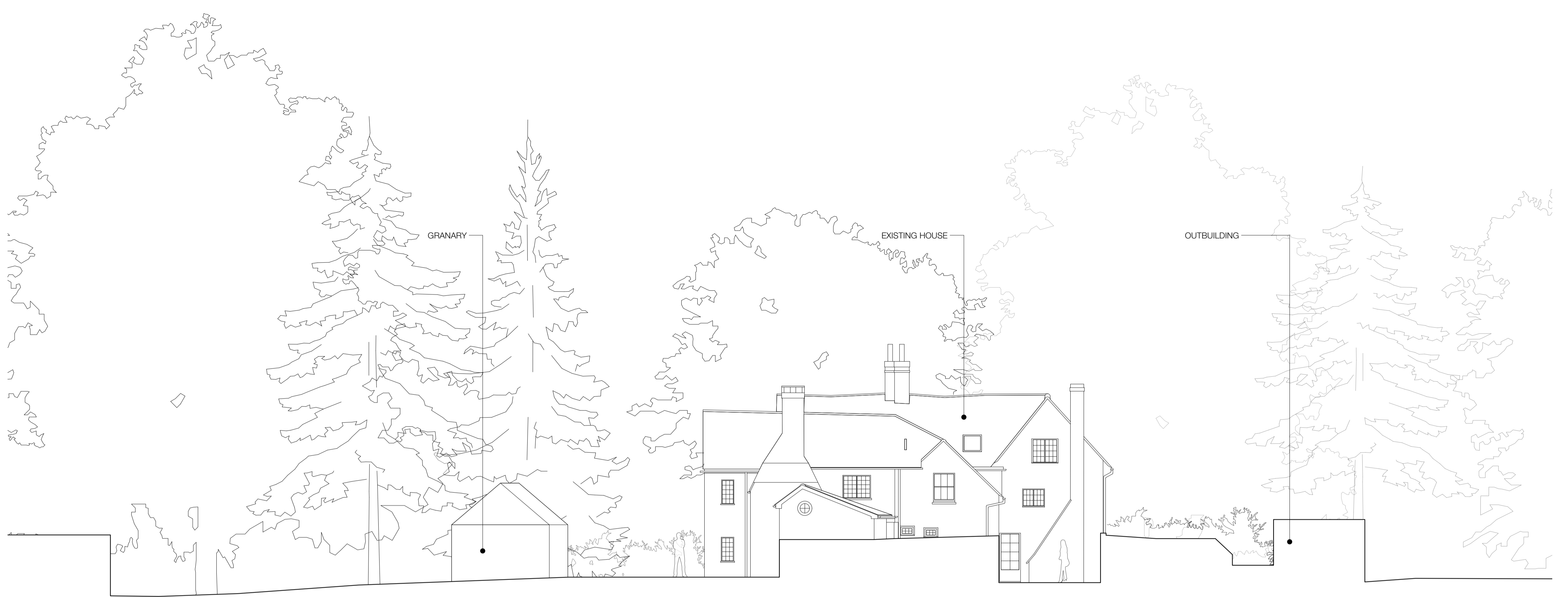
01 EXISTING SOUTHERN ELEVATION Scale: 1:100