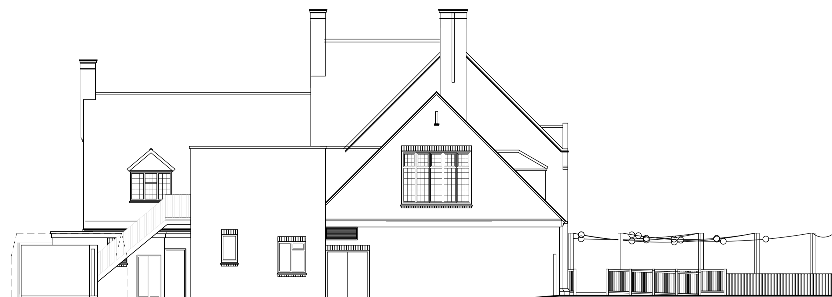
Elevation D-D Scale 1:100