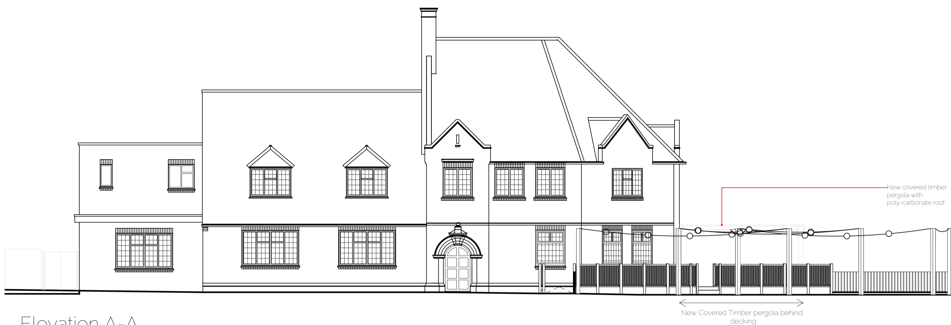
Elevation A-A Scale 1:100