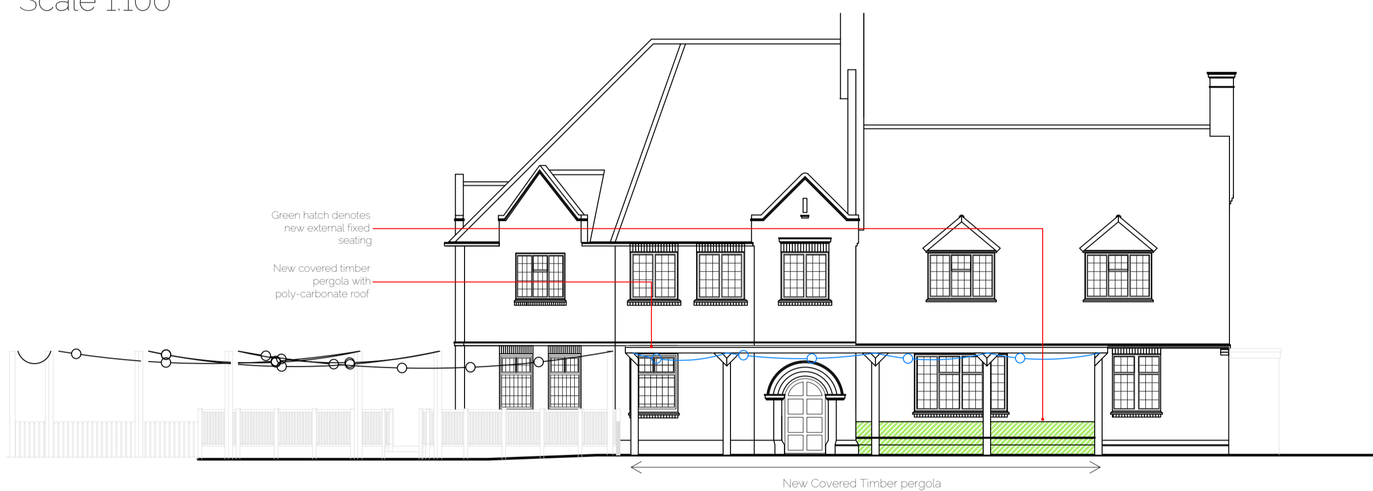
Elevation B-B Scale 1:100