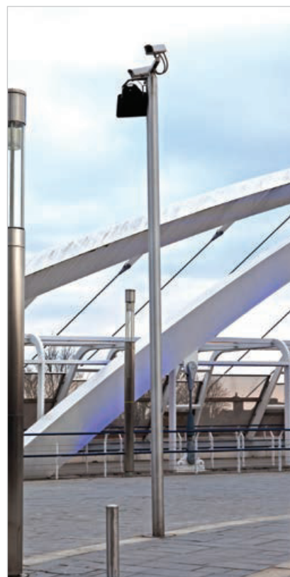
AW1592/6 in stainless steel