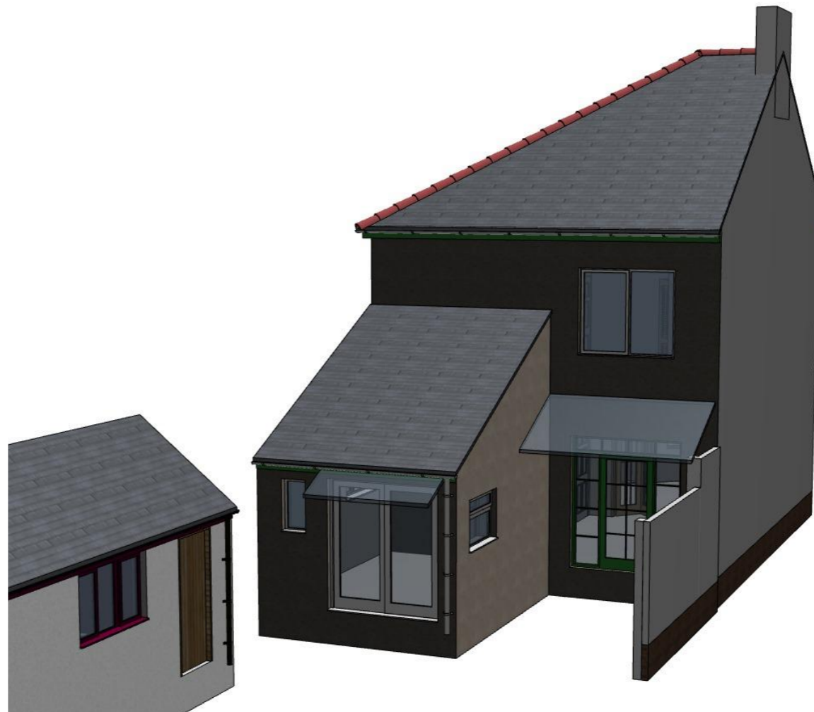
Existing 3-D Views to Front & Rear Scale N.T.S