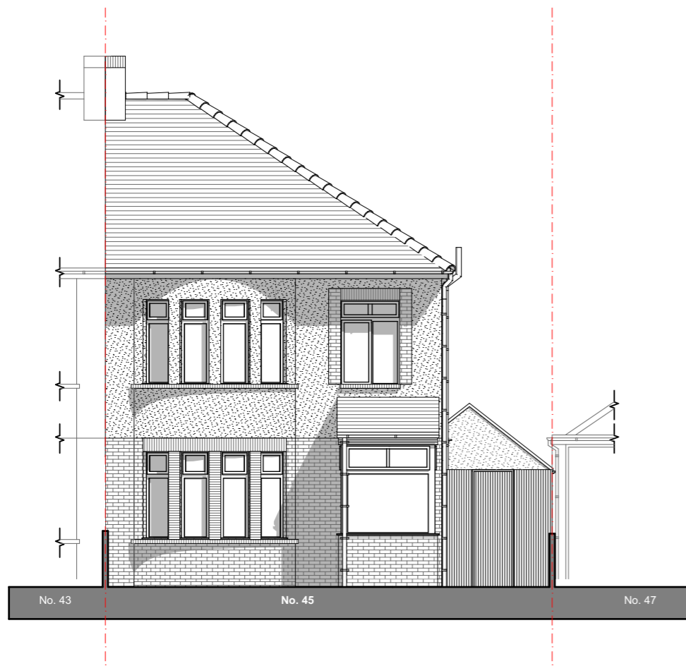
Existing Front Elevation - E01 Scale 1:100