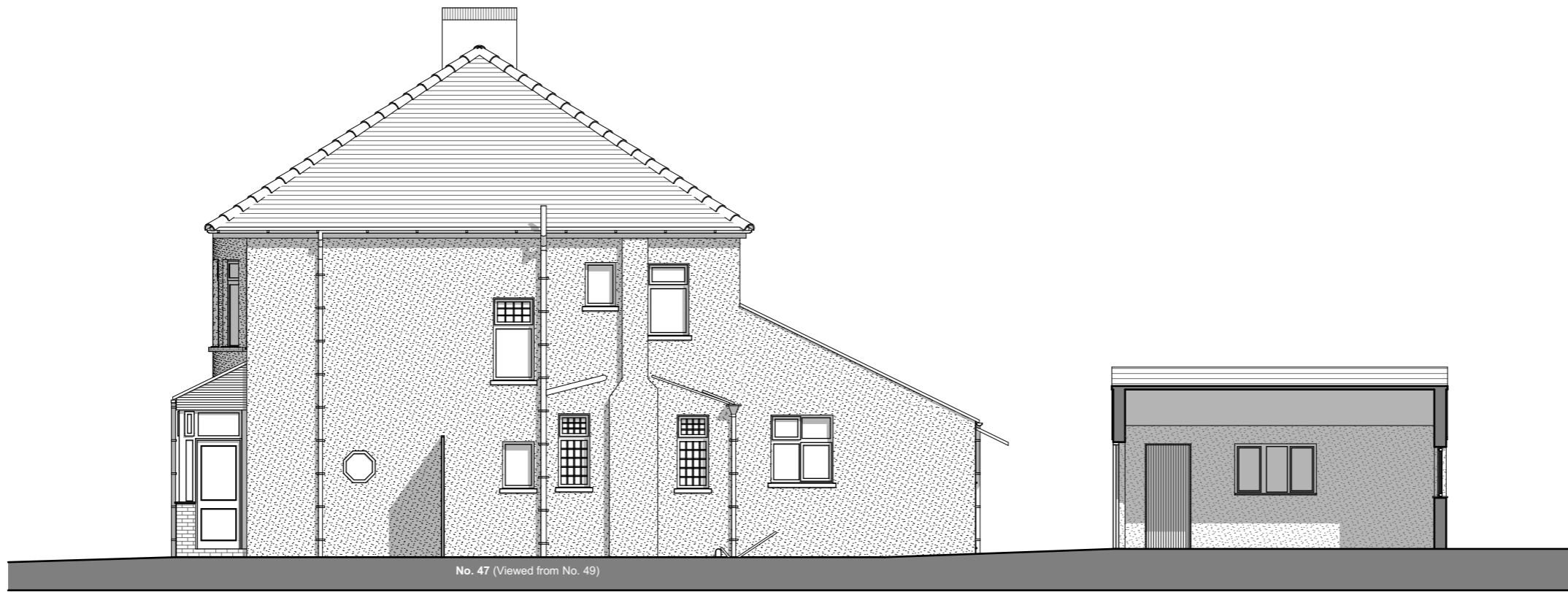
Existing Side Elevation - E02 Scale 1:100