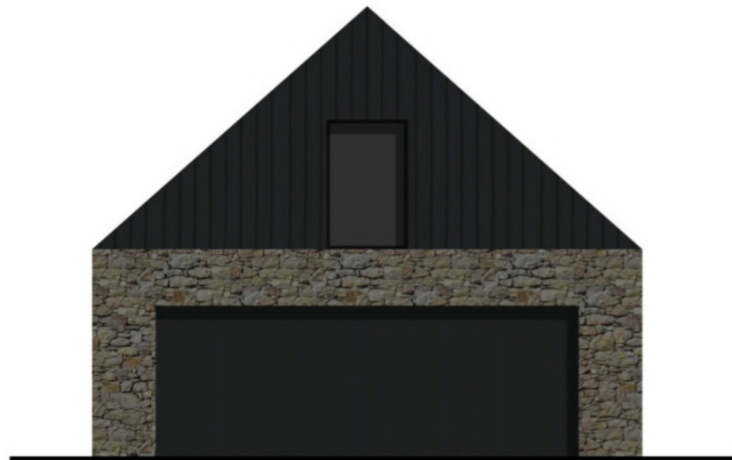
proposed garage rear elevation dwelling 1 scale 1:100