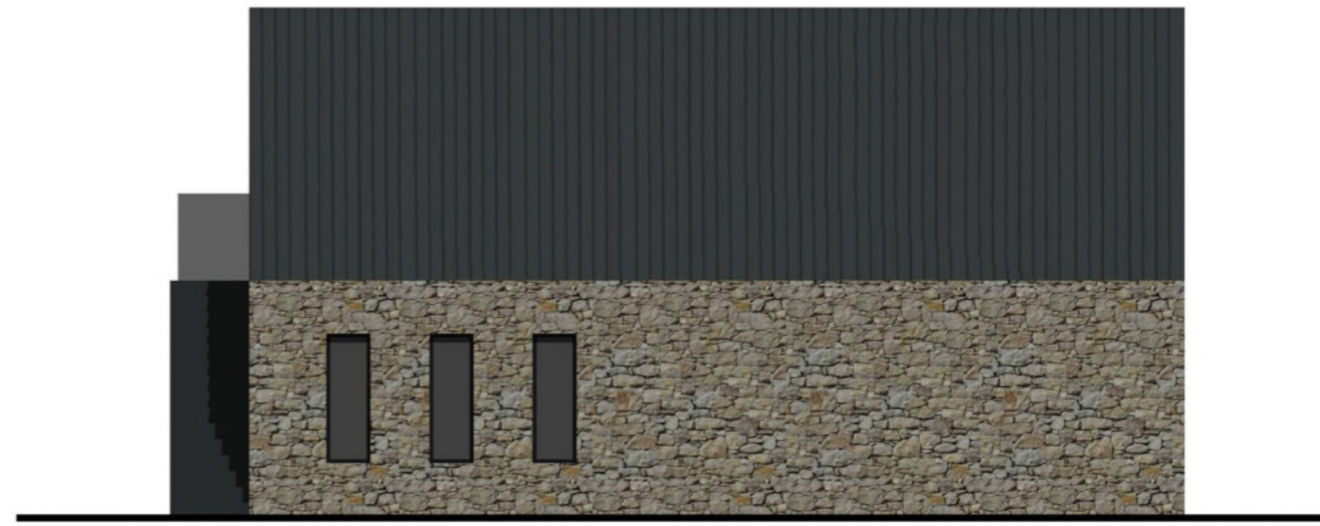
proposed garage rear elevation dwelling 1 scale 1:100