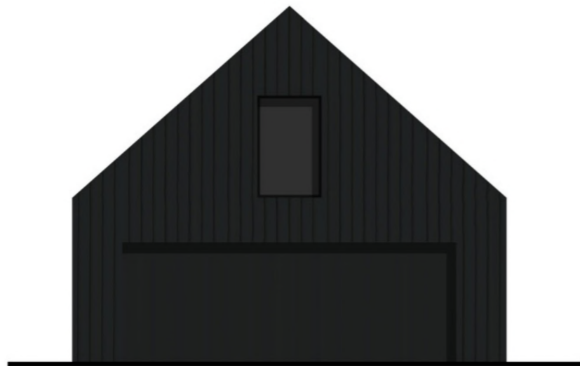
proposed garage rear elevation dwelling 1 scale 1:100