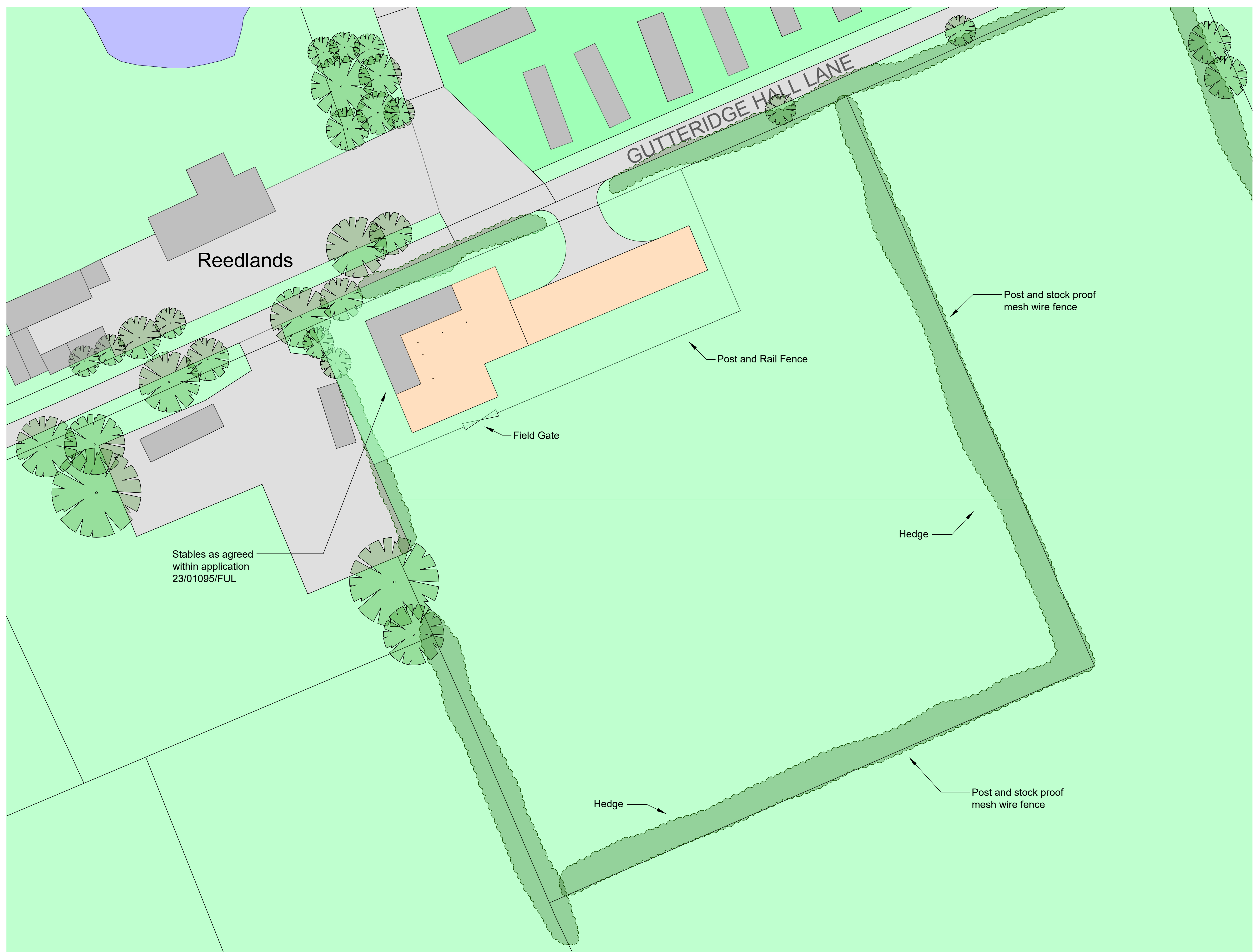
CURRENTLY APPROVED SITE PLAN SCALE 1:250