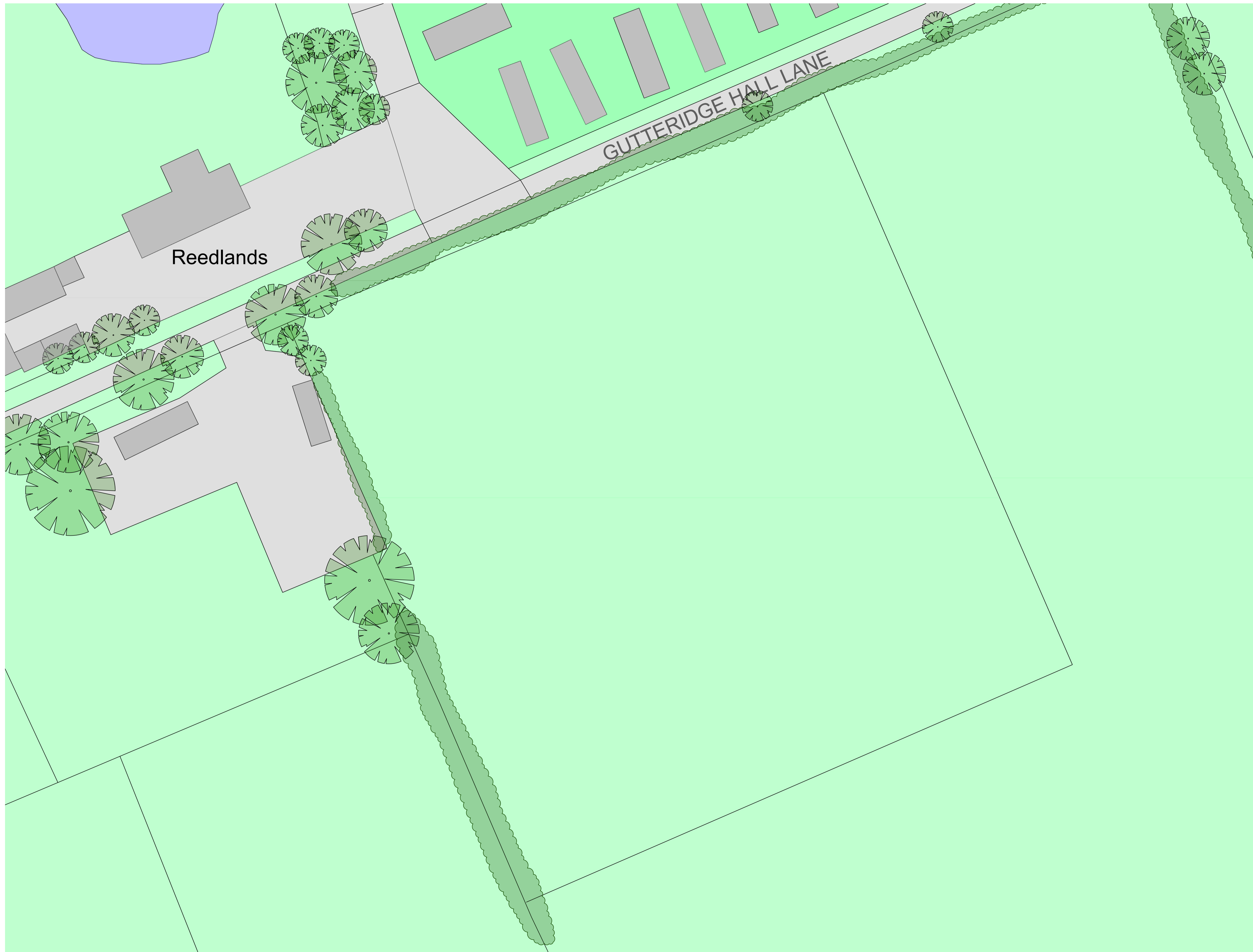
EXISTING SITE PLAN SCALE 1:250

© Copyright of Libre Solutions (Trading Name of Lord Residential Limited)