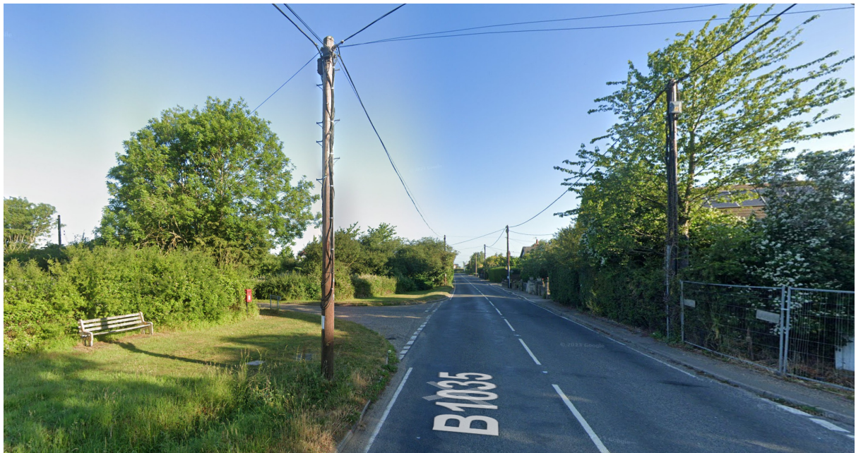
Pilcox Hall Lane Junction