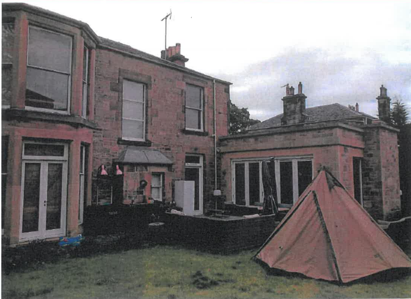
photographs of elevation as existing nts.