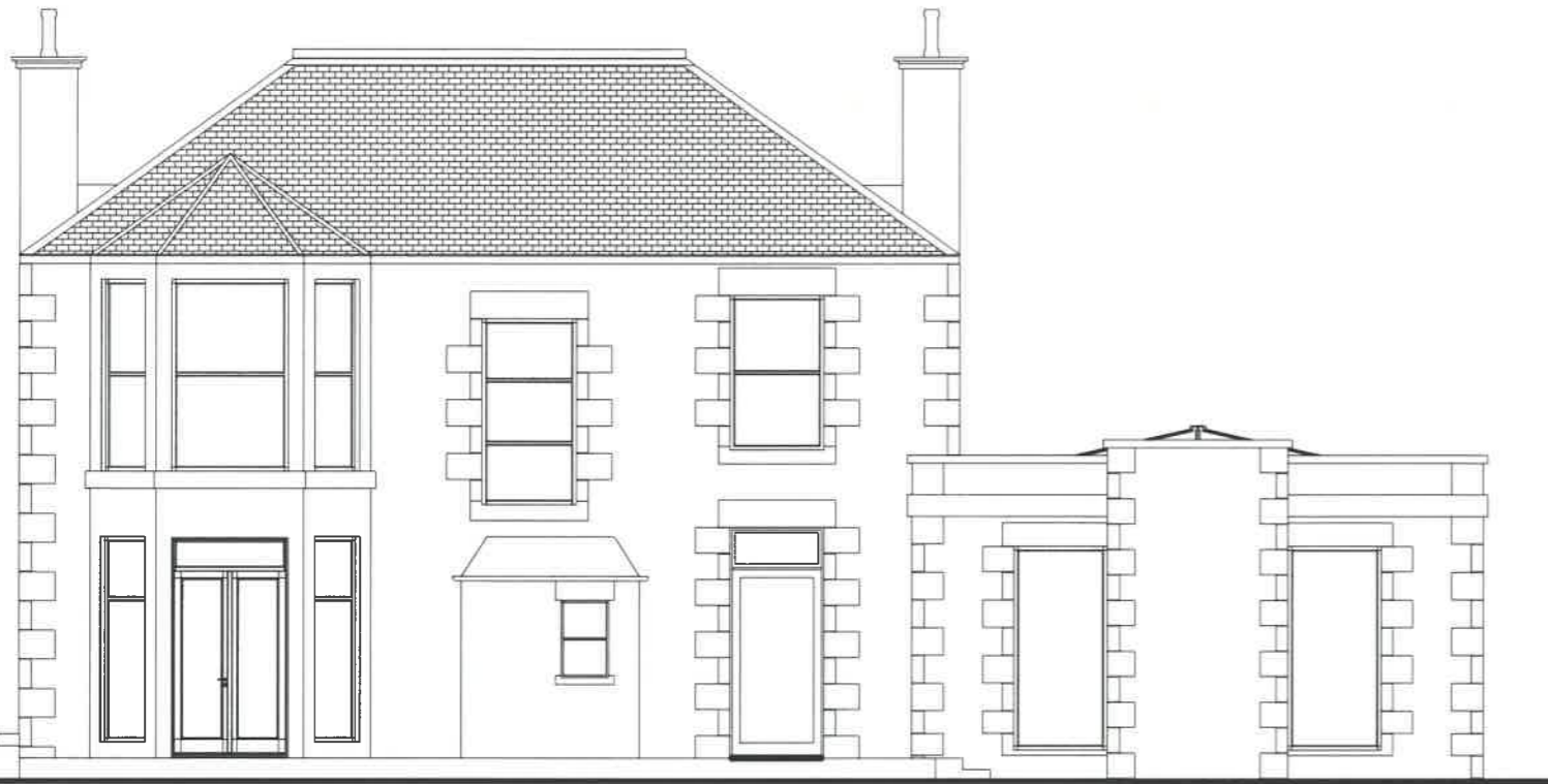
Existing South Elevation scale : 1.100