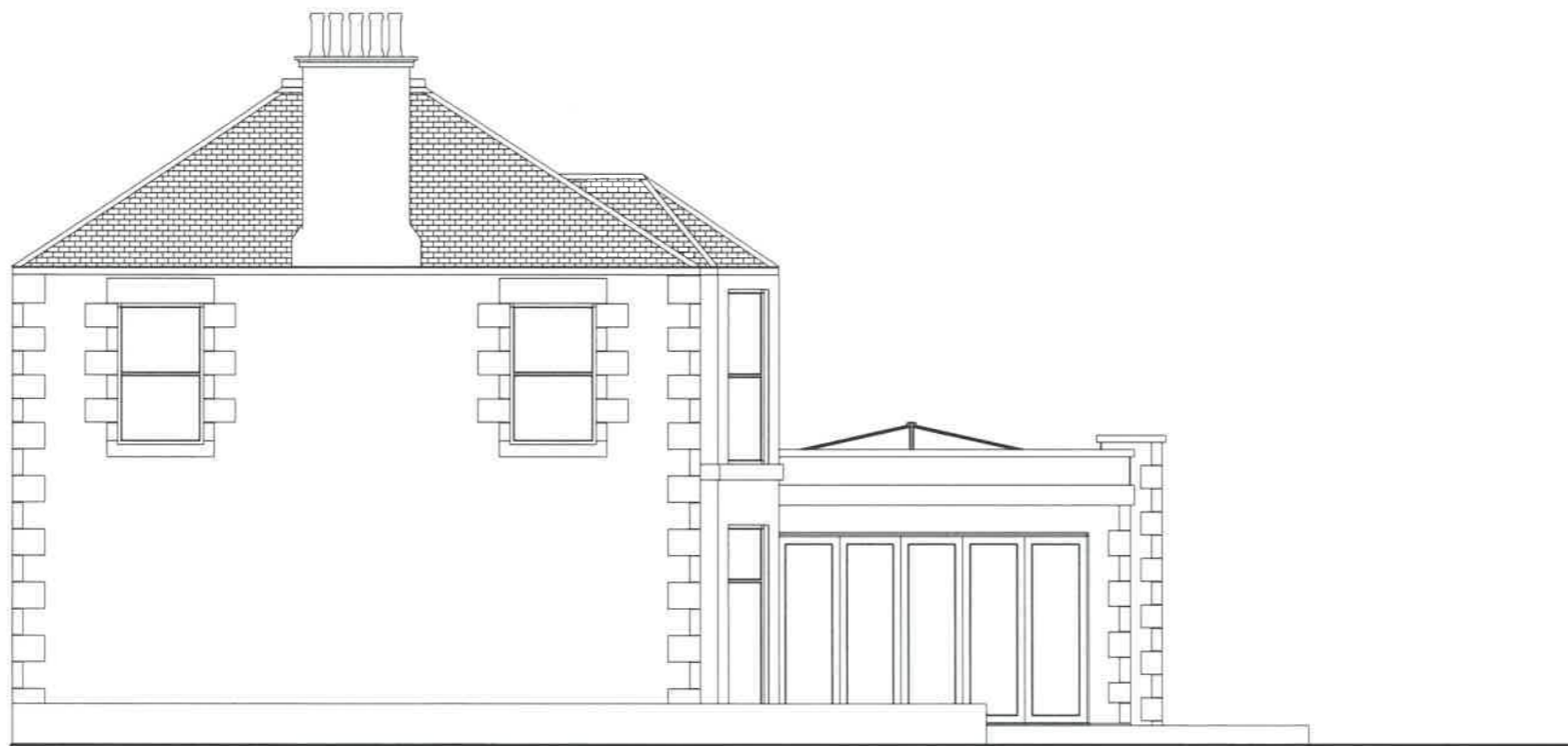
Existing West Elevation scale : 1.100