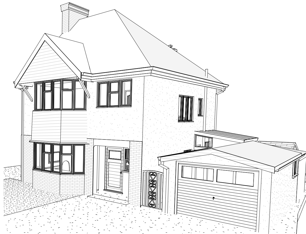
Front Eye View