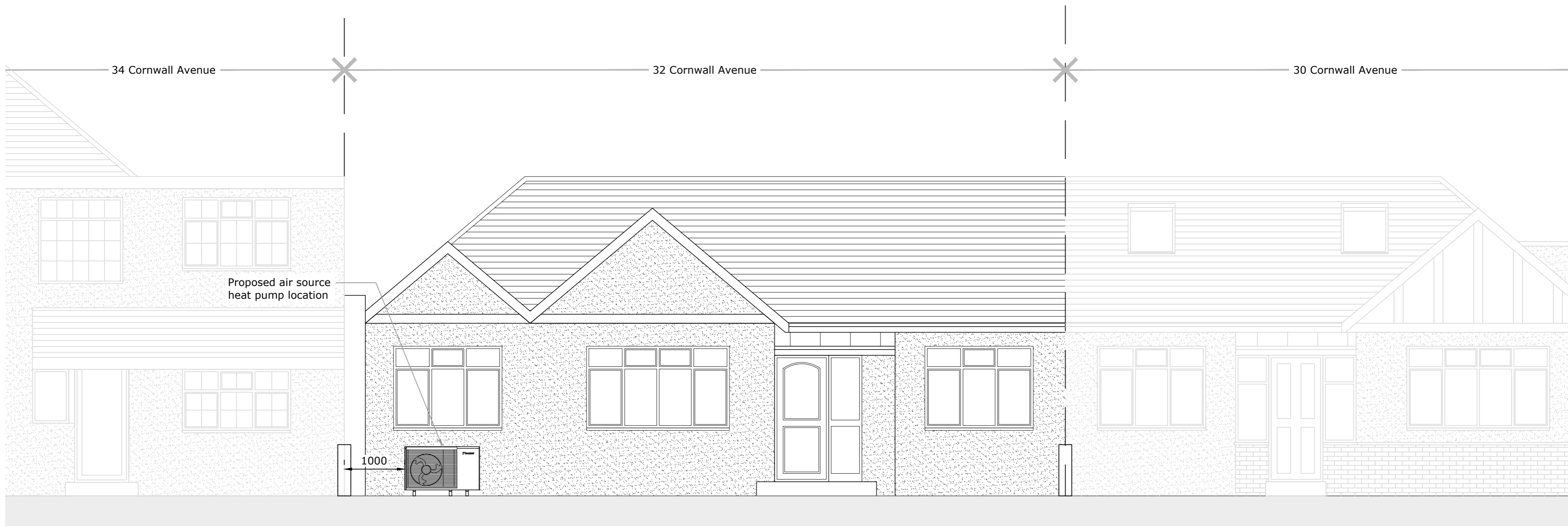
front elevation (north east facing) as proposed 1:50