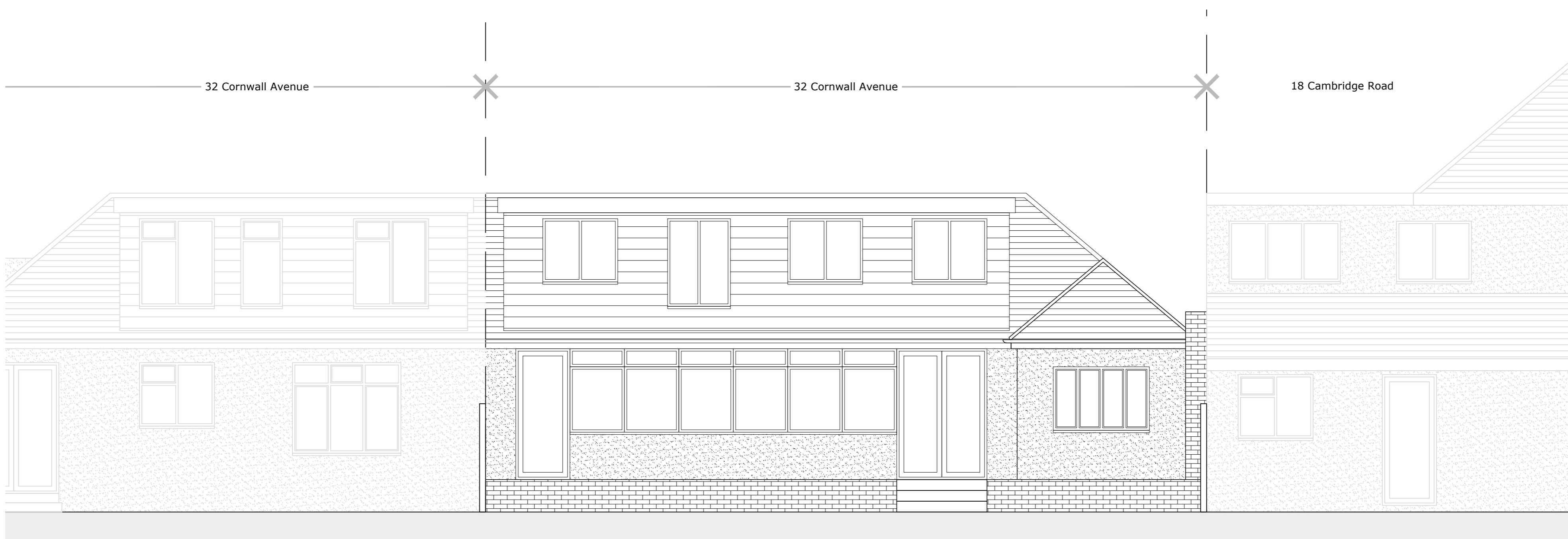
rear elevation (south west facing) as proposed 1:50