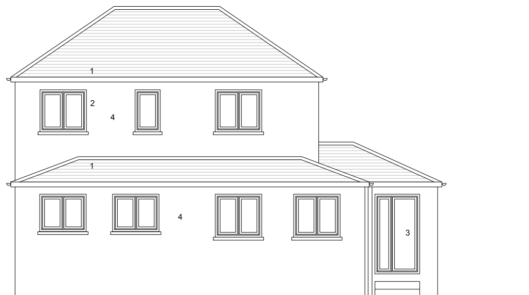
Existing East Elevation