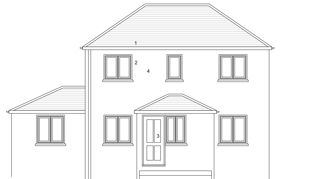
Existing West Elevation