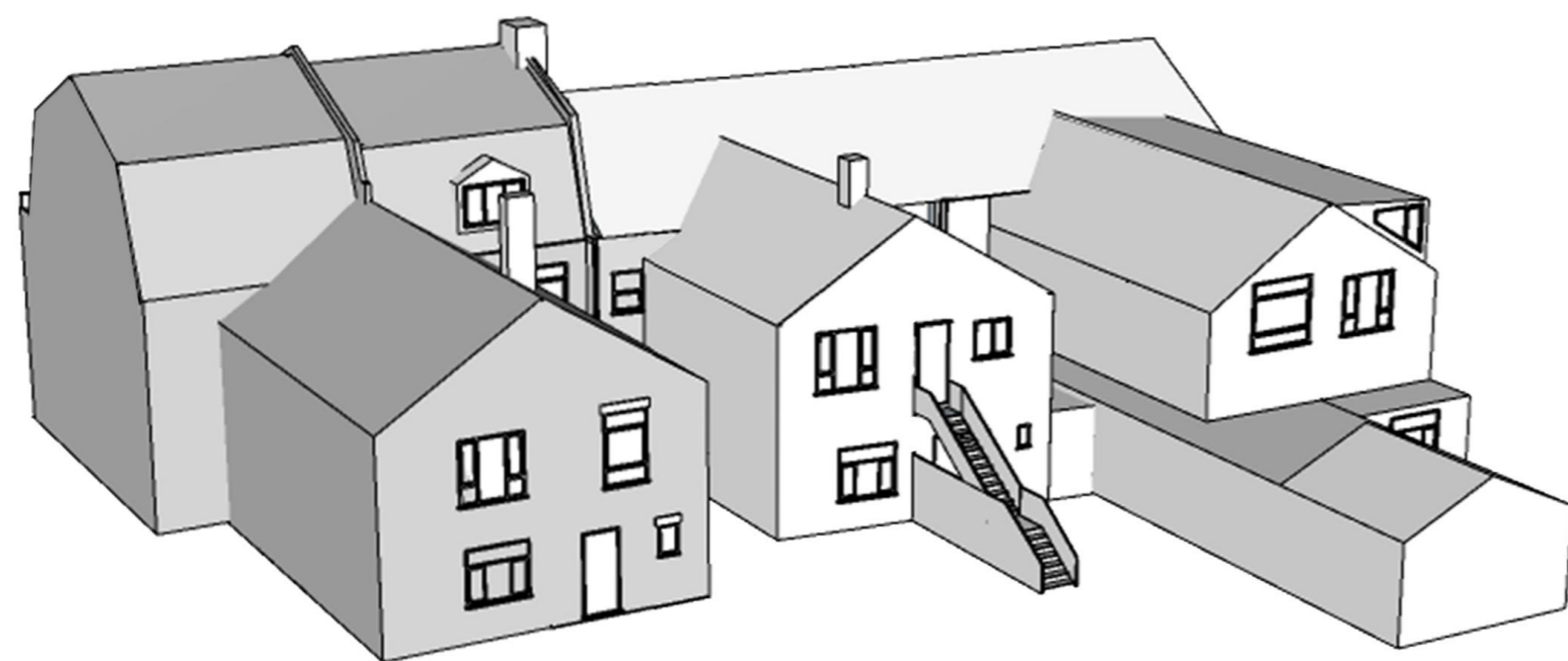
EXISTING REAR VIEW (NORTH-EAST)