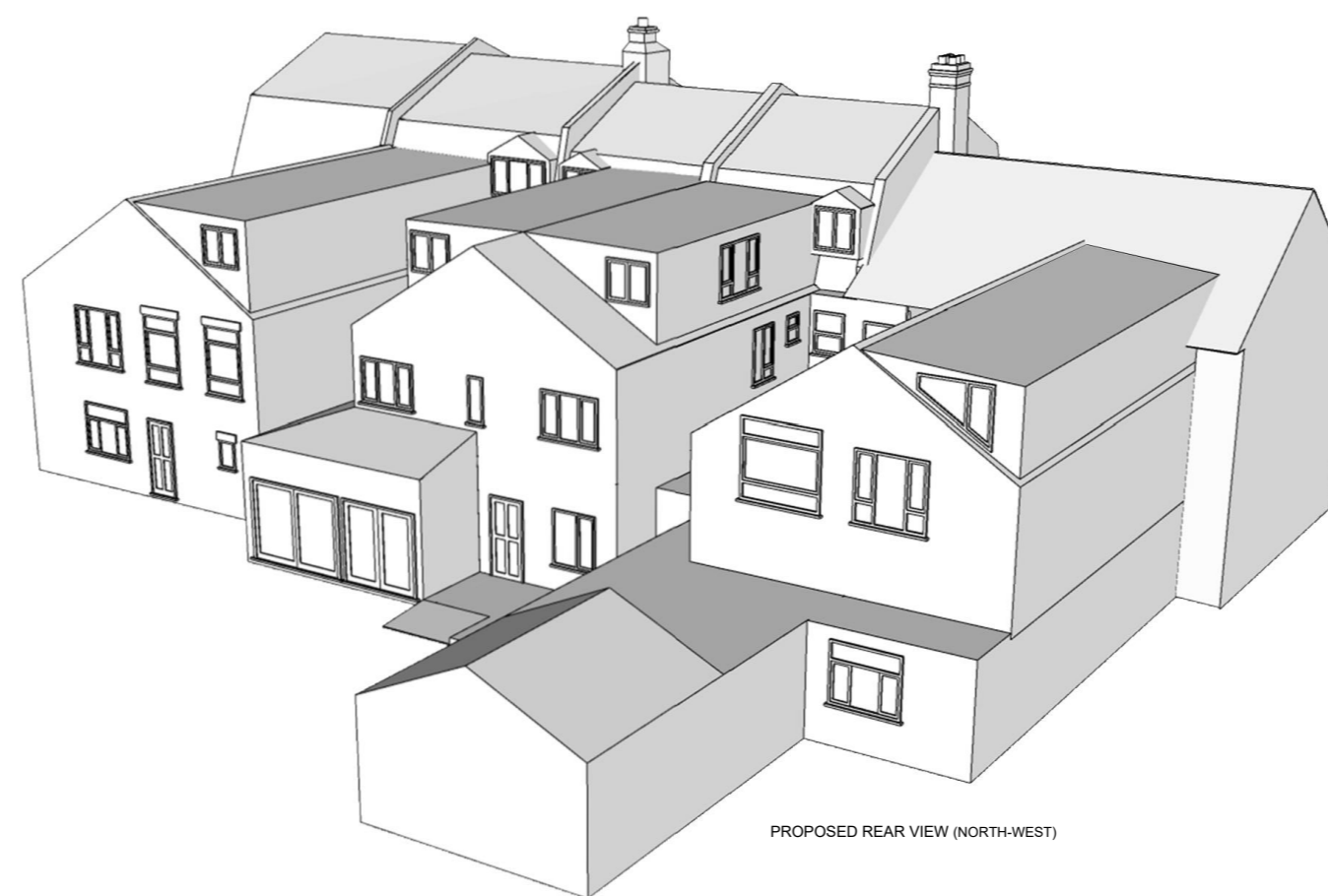
PROPOSED REAR VIEW (NORTH-WEST)