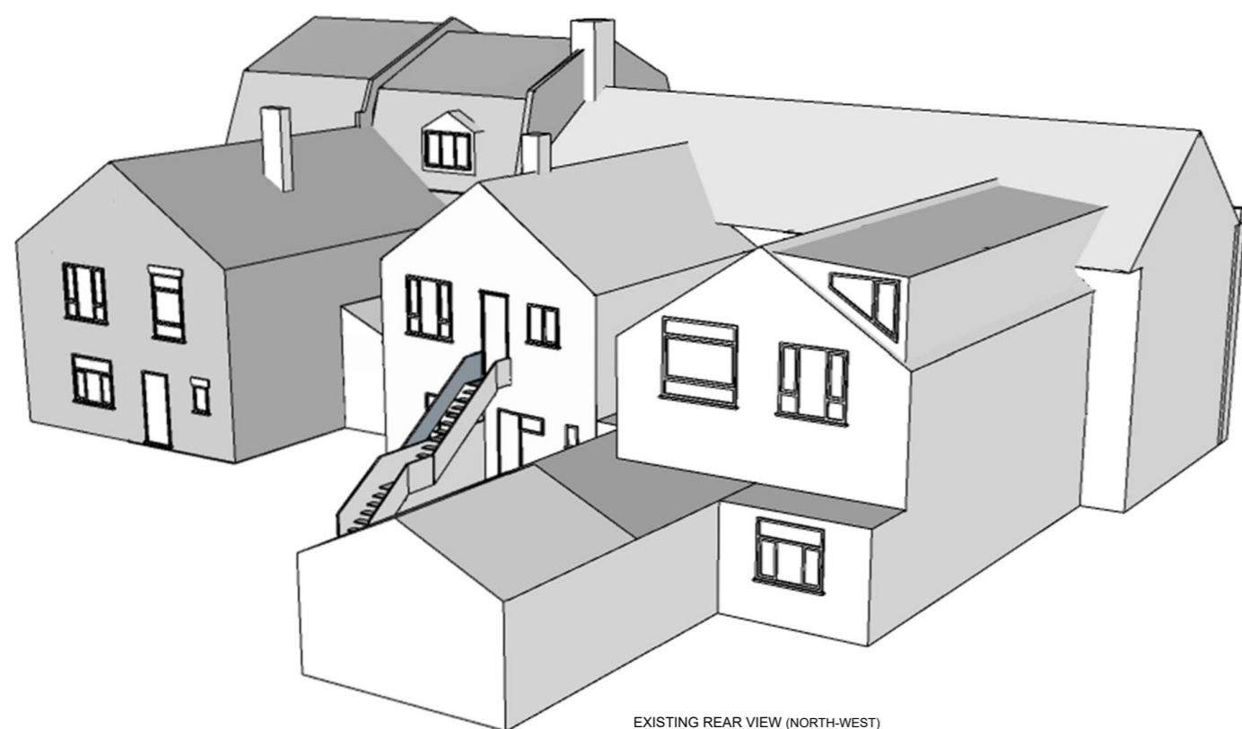
EXISTING REAR VIEW (NORTH-WEST)