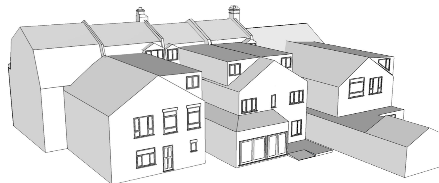
PROPOSED REAR VIEW (NORTH-EAST)