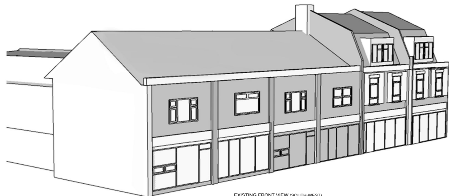
EXISTING FRONT VIEW (SOUTH-WEST)

Contractor to check site thoroughly & report any discrepancies.