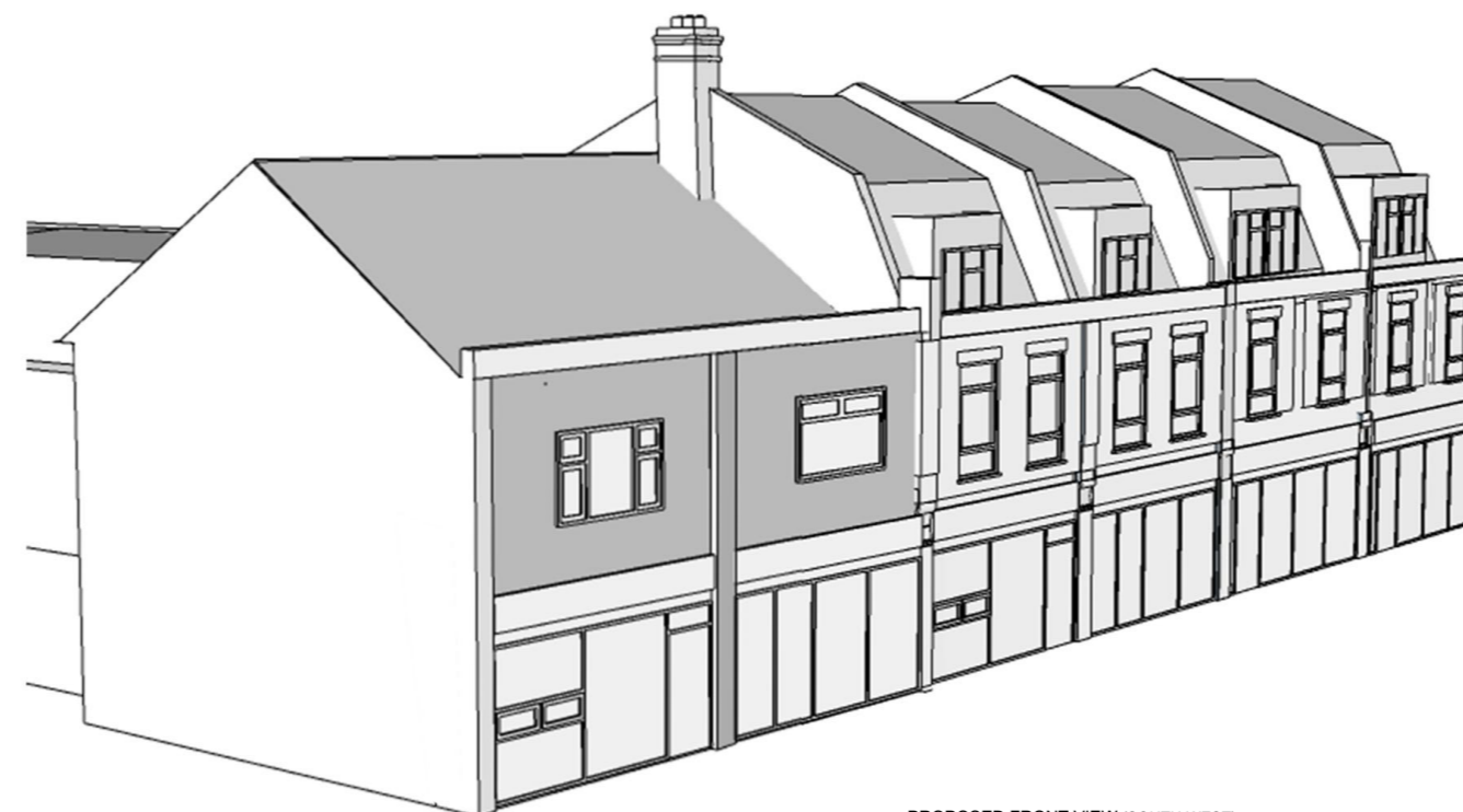
PROPOSED FRONT VIEW (SOUTH-WEST)