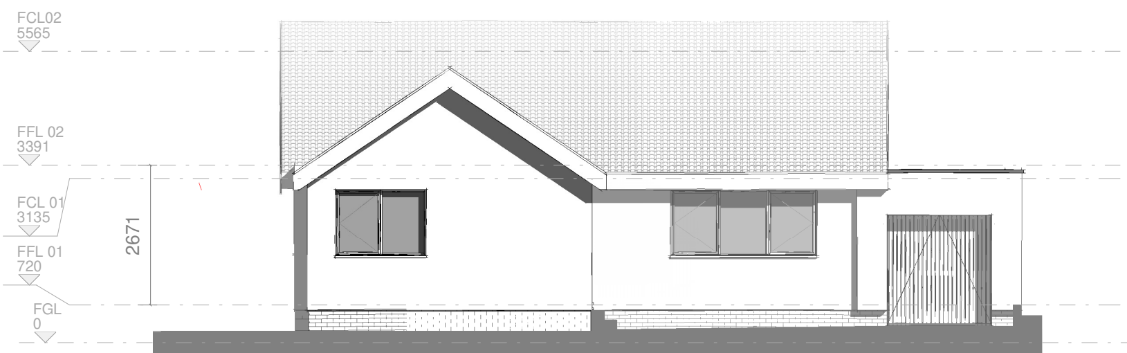
South East Facing 1 : 100