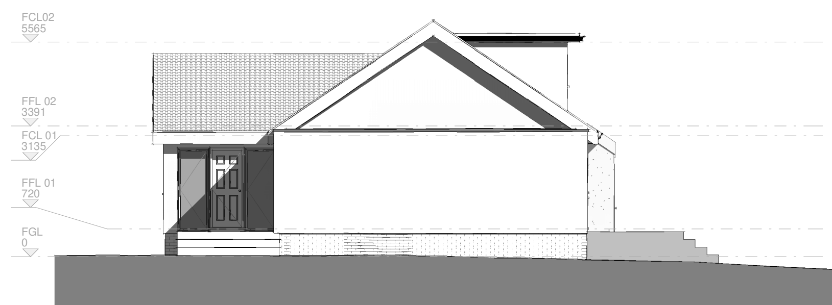
North East Facing 1 : 100