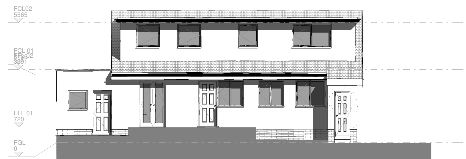
North West Facing 1 : 100