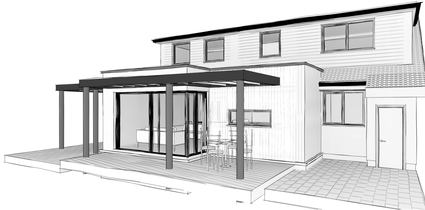
View from North West