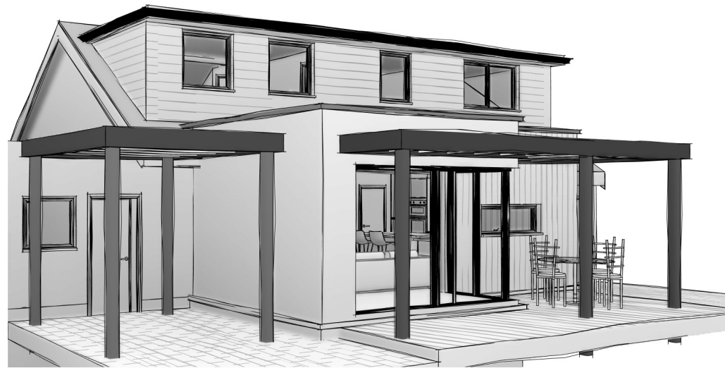
View from North East