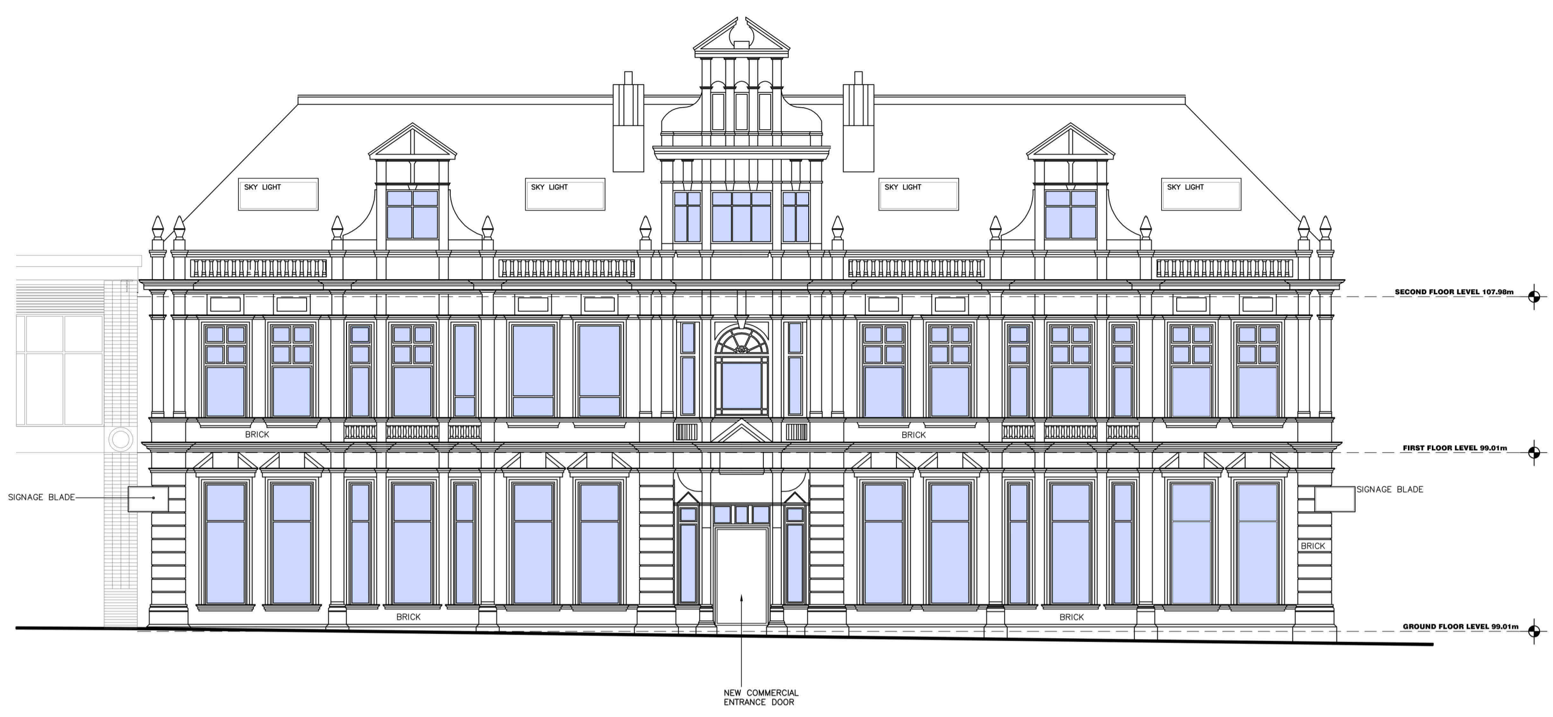
Front Elevation (High Street)