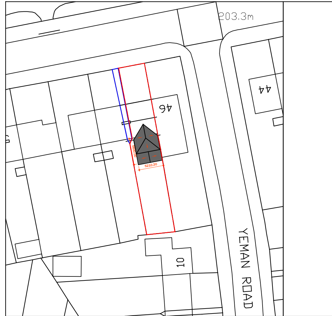
302 LOCATION PLAN 1:500 @ A3