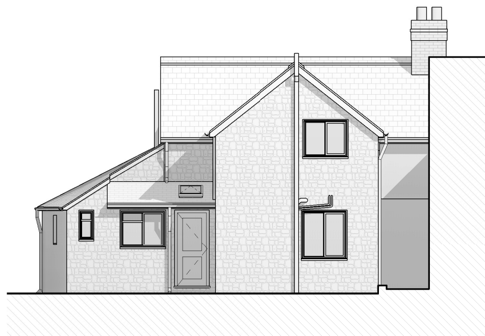
Rear Elevation 1 : 100