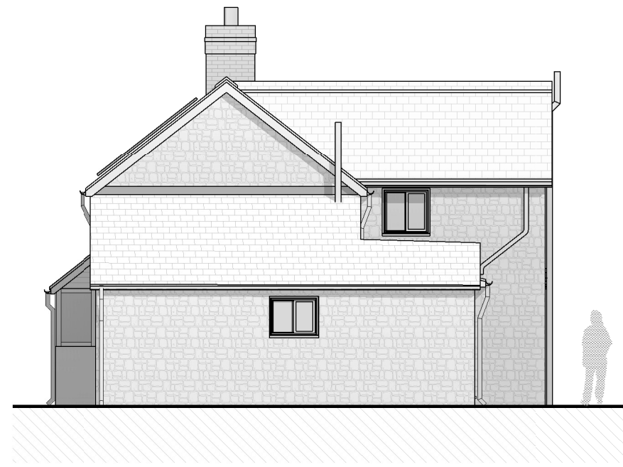
Side Elevation 1 : 100