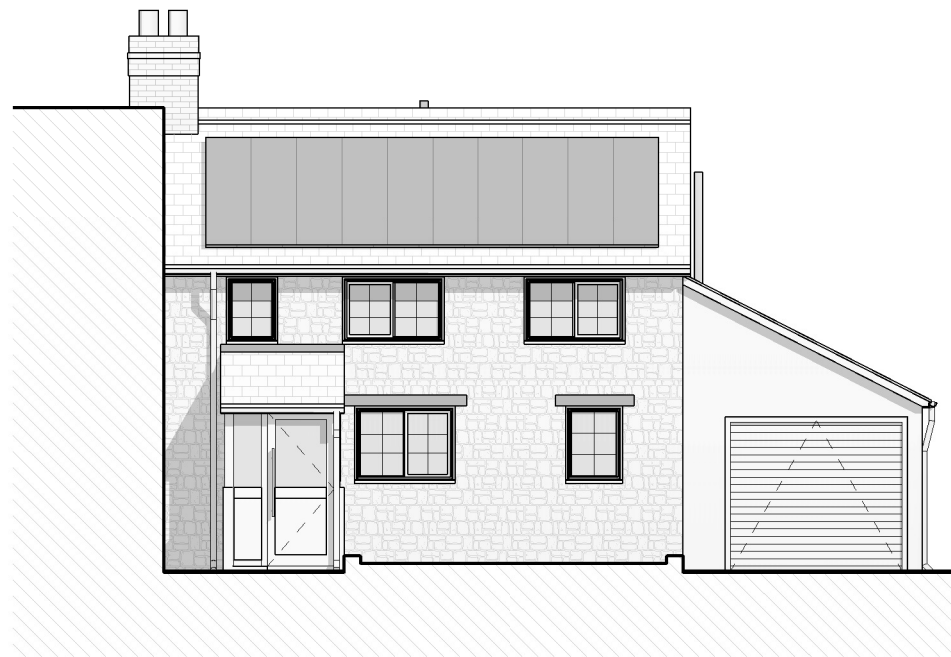
Front Elevation 1 : 100