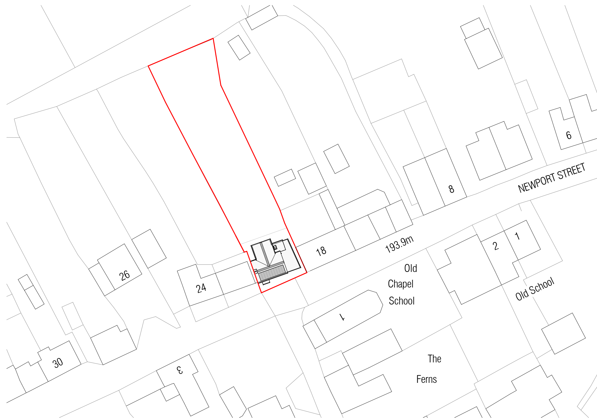
Existing Block Plan 1 : 500