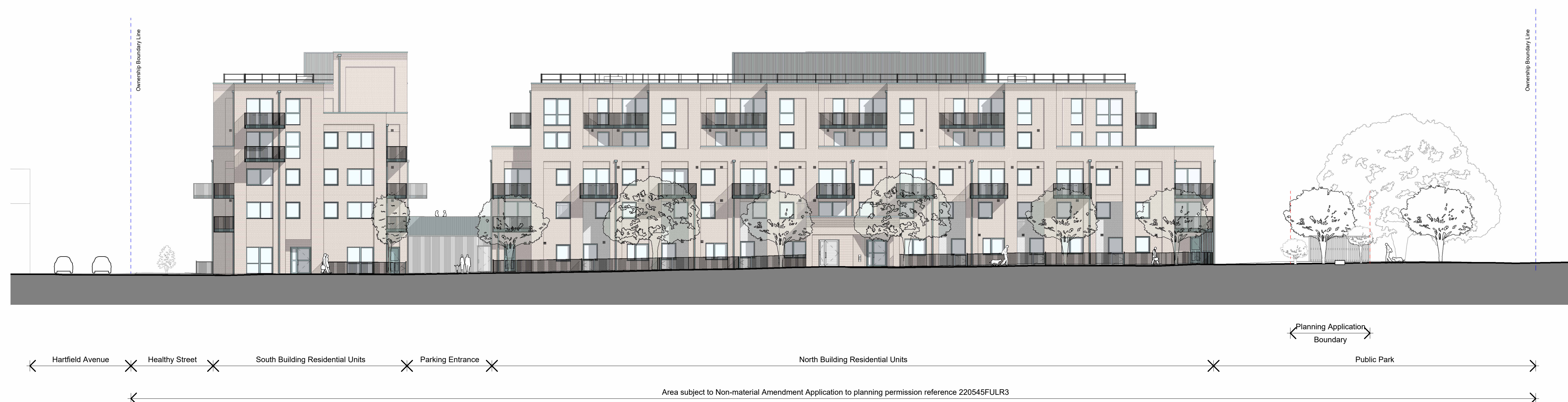
2 Proposed East Elevation (Rushdene Crescent) 1:200