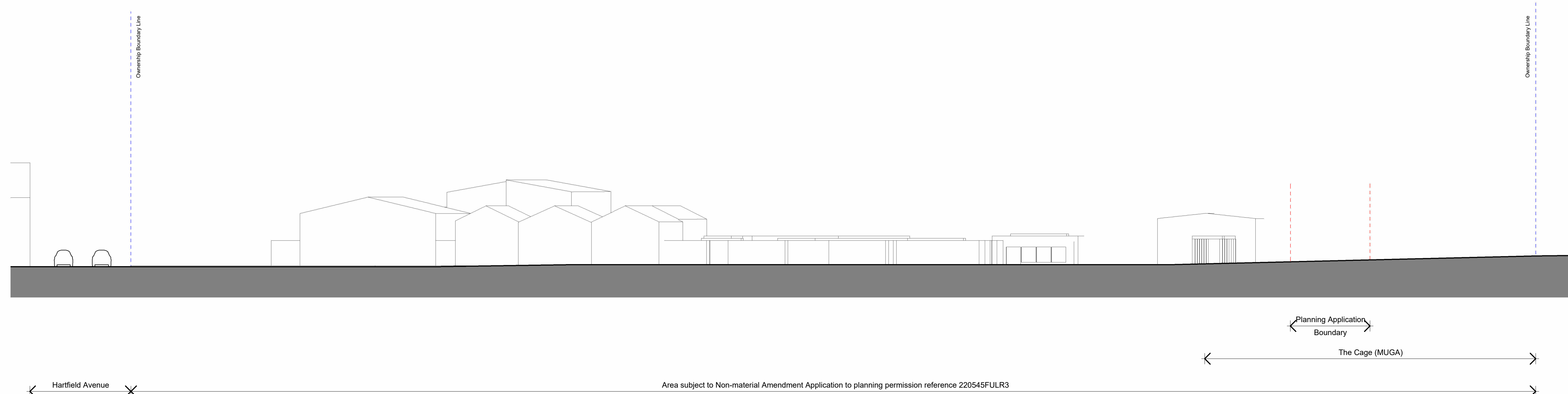
1 Existing East Elevation (Rushdene Crescent) 1:200