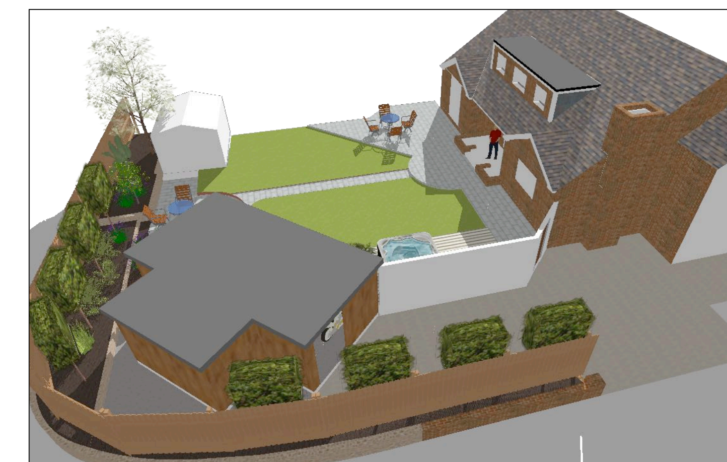
VIEW ACROSS GARDEN FROM ROOFLINE