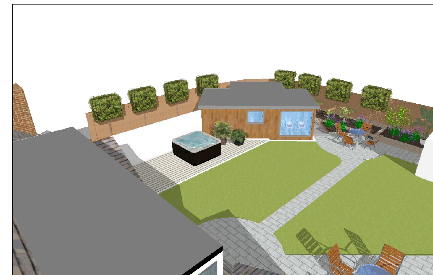
VIEW ACROSS GARDEN FROM ROOFLINE