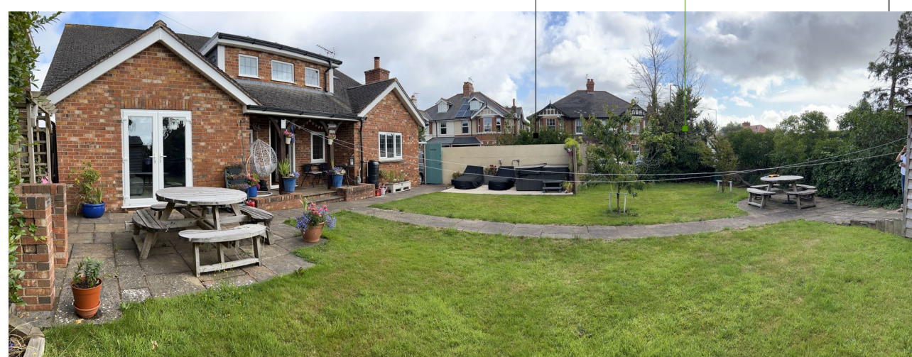
EXISTING GARDEN LAYOUT