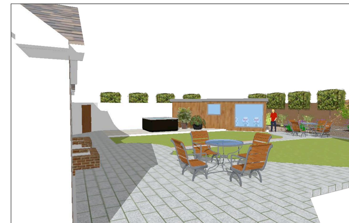
VIEW ACROSS GARDEN FROM CORNER OF HOUSE