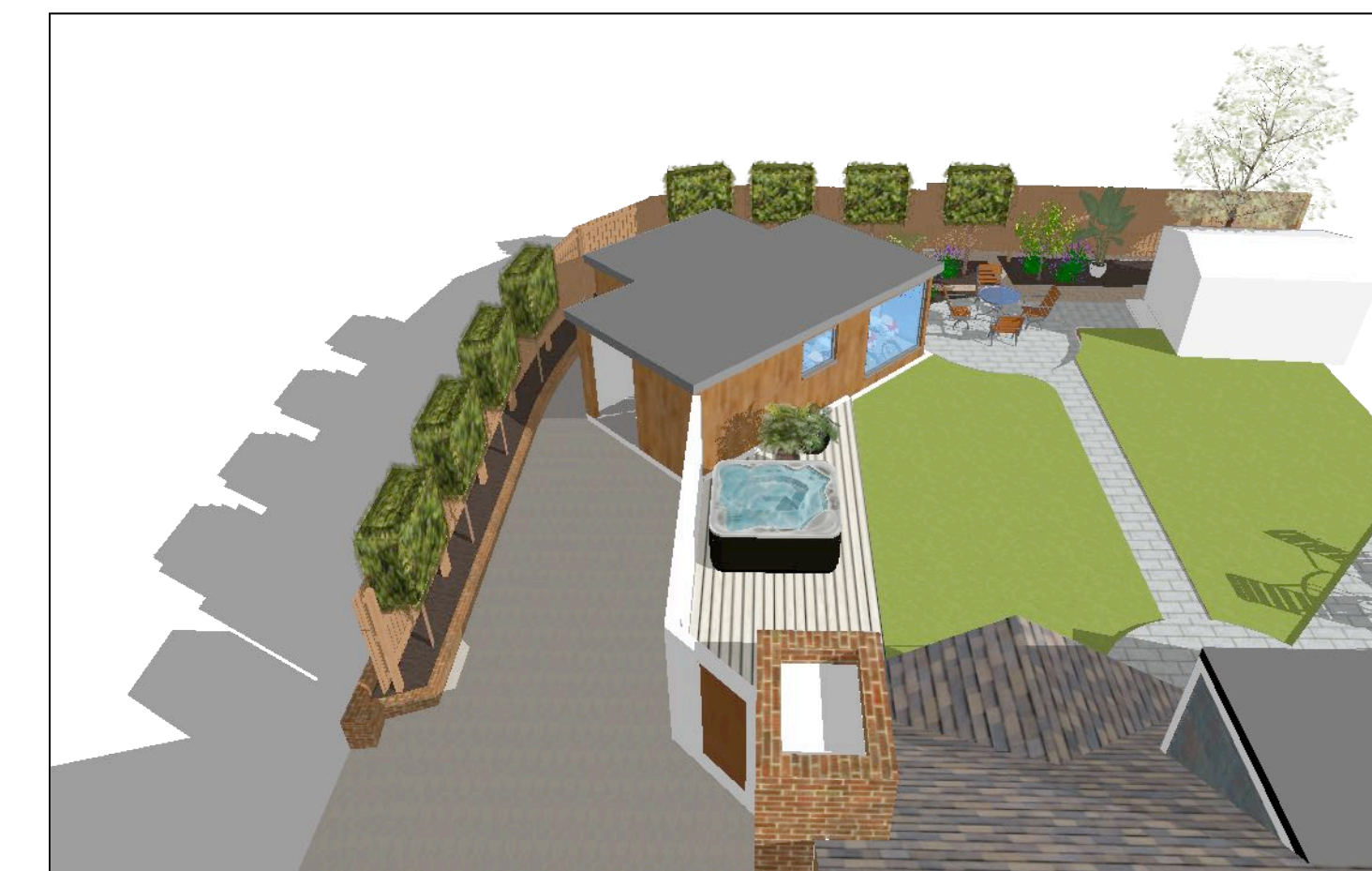
VIEW ACROSS GARDEN FROM ROOFLINE