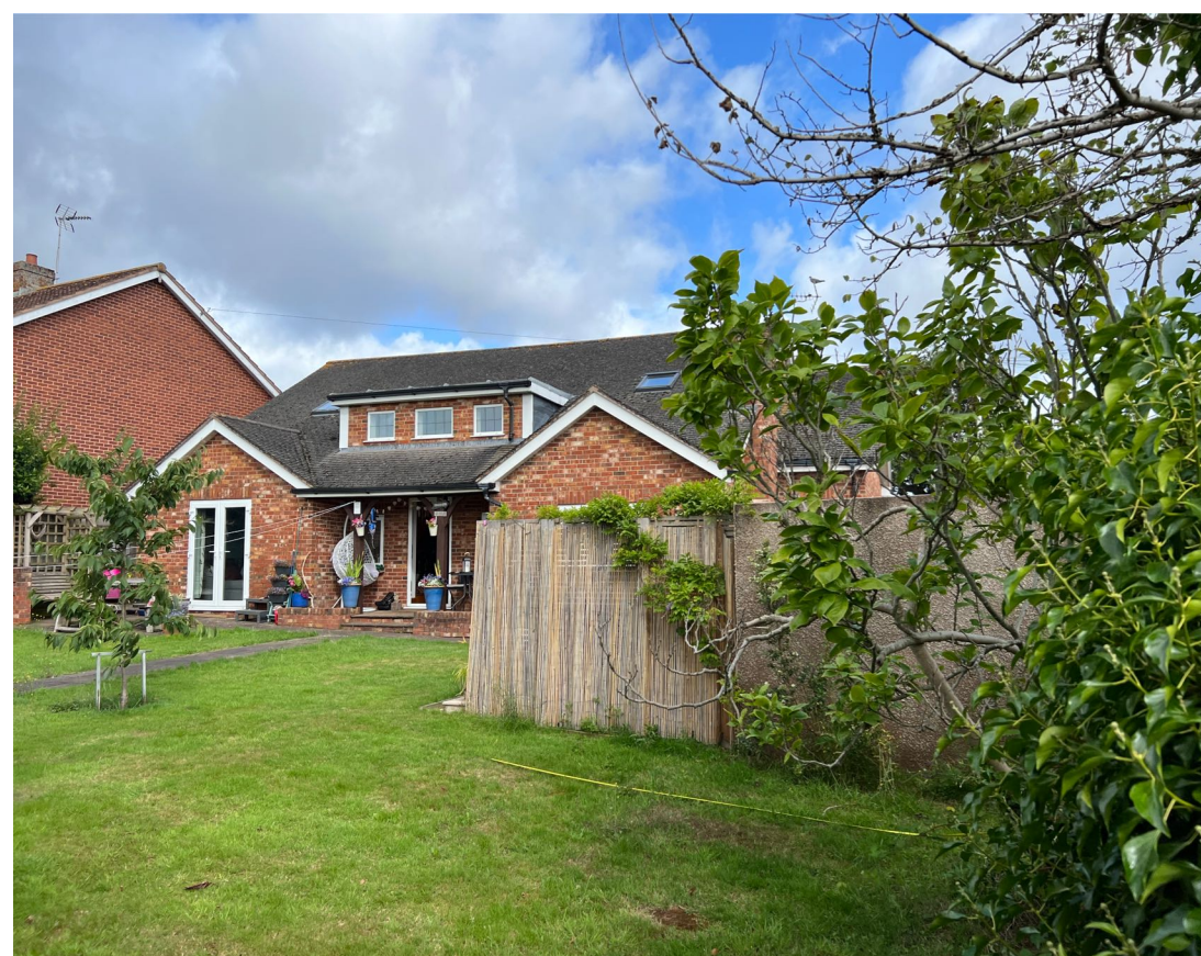
EXISTING GARDEN LAYOUT

ENHANCES THE EXISTING BOUNDARY BY PROPOSING REMOVAL OF EXISTING DECEASED ELM TREES & INVASIVE IVY & SMALL CONIFER HEDGE.