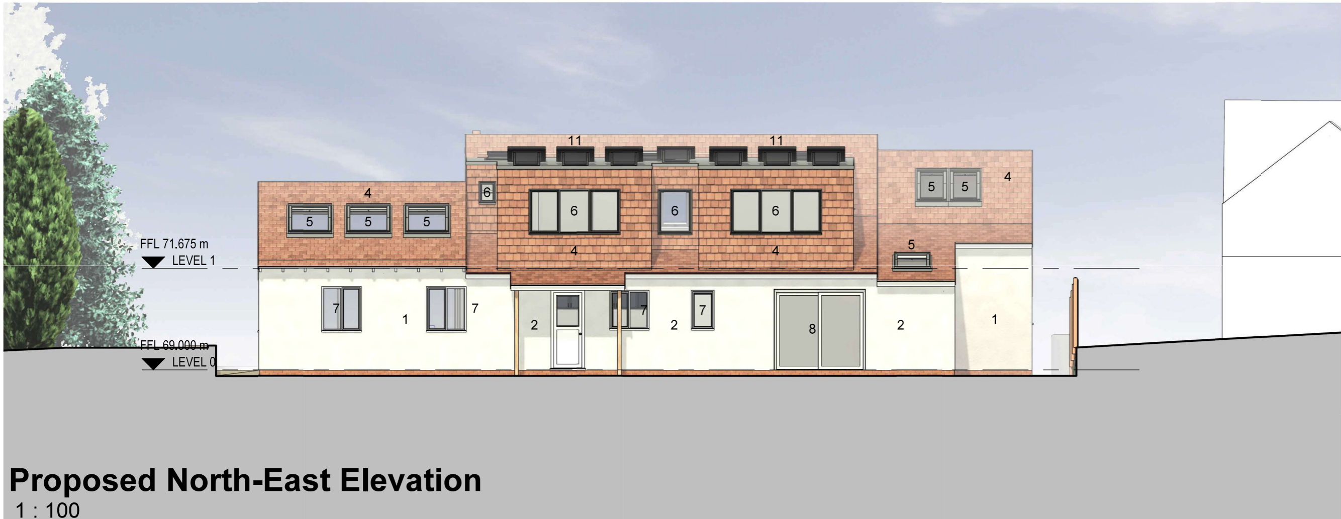
Proposed North-East Elevation 1 : 100