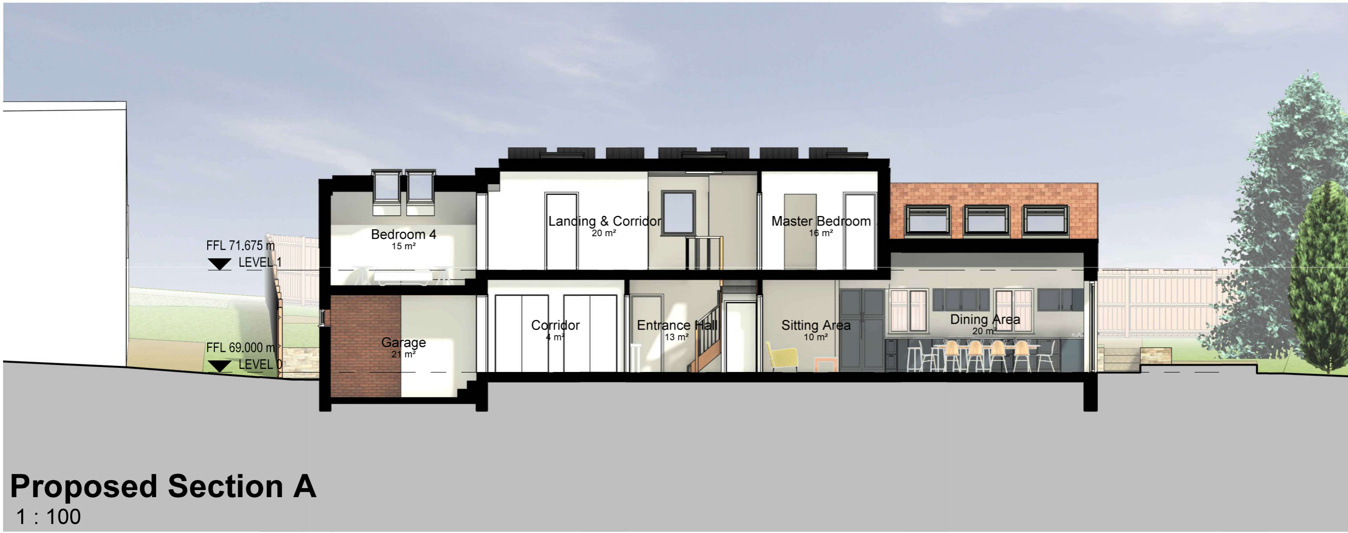
Proposed Section A 1 : 100