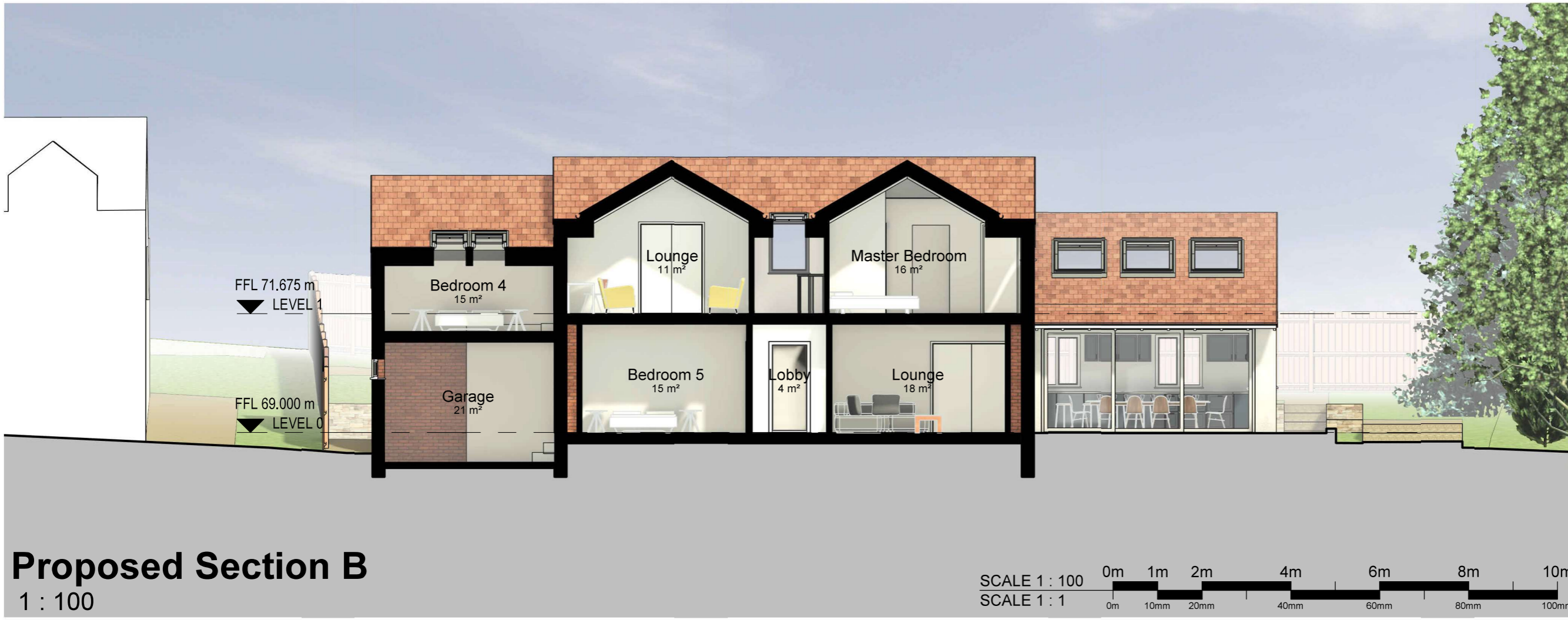
Proposed Section B 1 : 100