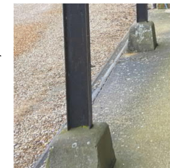
Concrete staddles with vertical steel beams