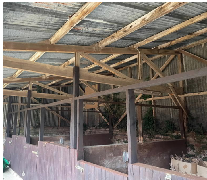
Structural timbers tannalised softwood with galvanised steel sheets above