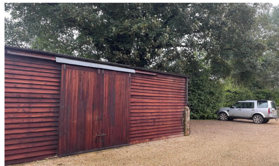
Stained softwood cladding to enclosed parts