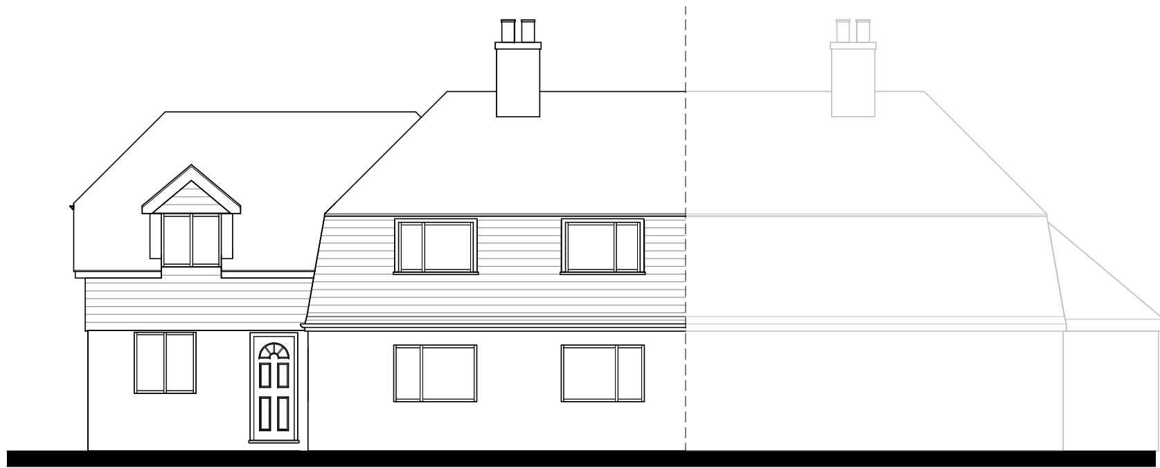
1 Existing Front Elevation 001 Scale - 1 : 100