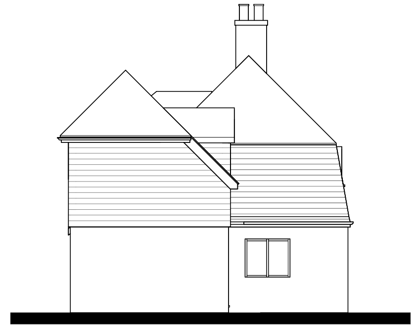
2 Existing Side Elevation 001 Scale - 1 : 100