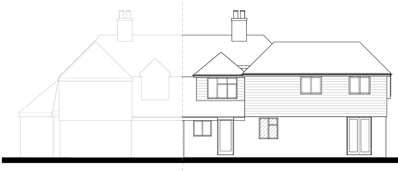
3 Existing Rear Elevation 001 Scale - 1 : 100