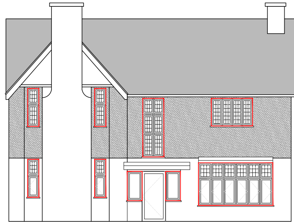
EAST FACING ELEVATION 1:100 SCALE