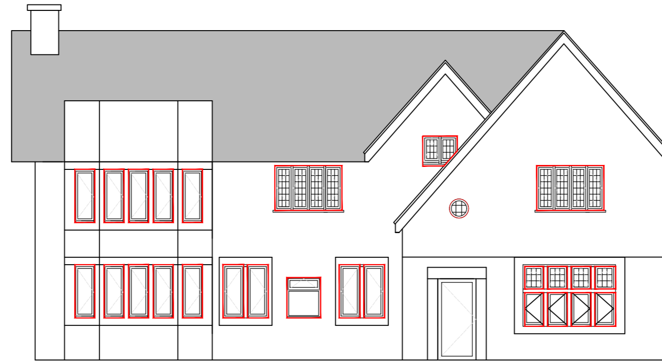
SOUTH FACING ELEVATION 1:100 SCALE