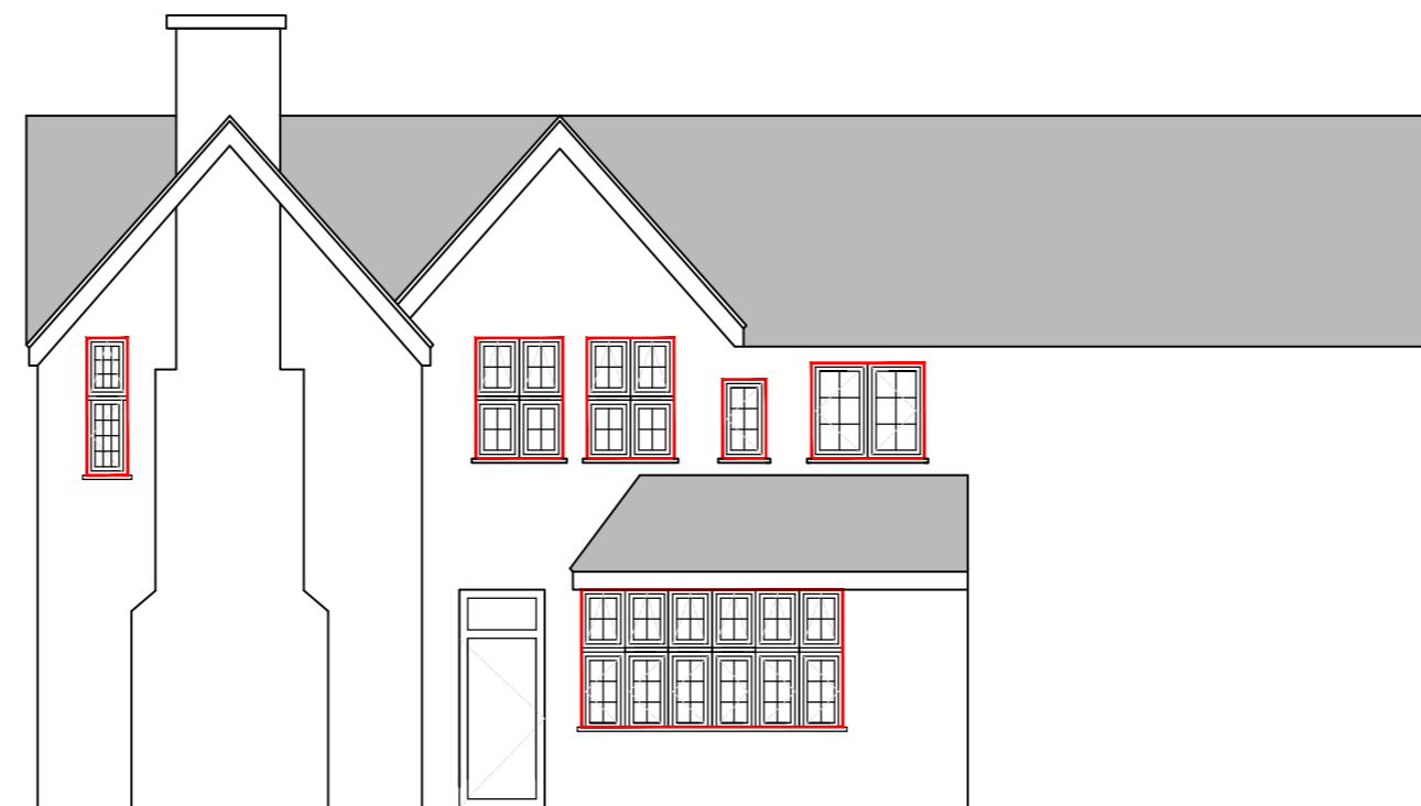
NORTH FACING ELEVATION 1:100 SCALE