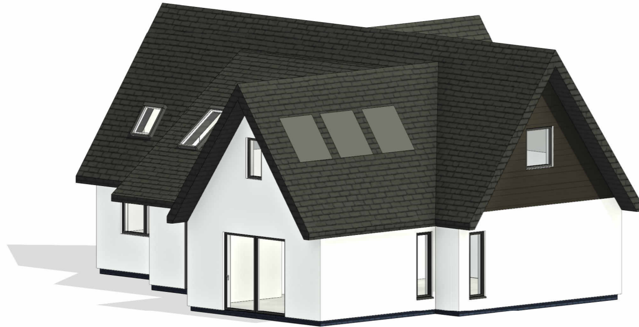
1 3D South West

© CICERO COMMUNICATIONS LTD., 2023 Trading as Planning Direct - Co. No. 07986959