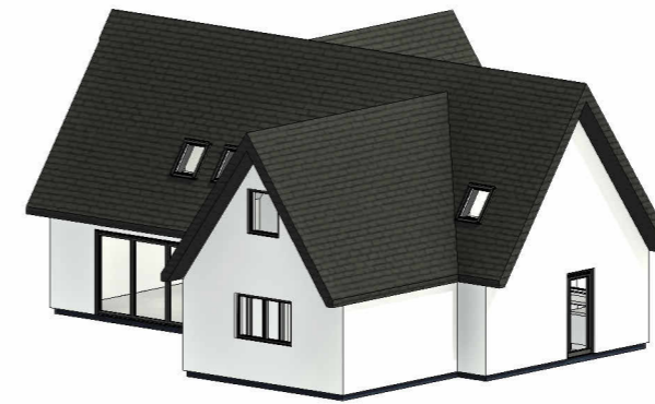
3 3D North East