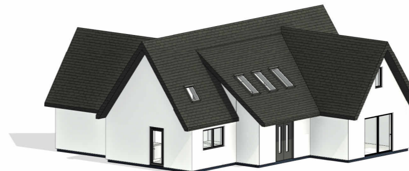
4 3D North West