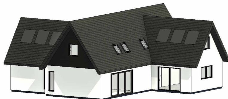
2 3D South East