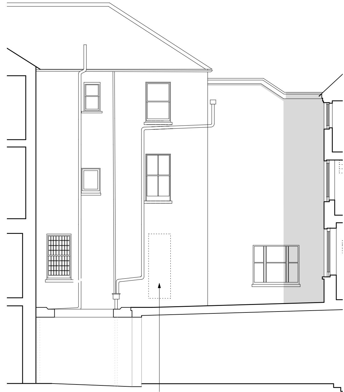
Existing Section A 1:100 @A3

Fire escape door has been removed and infilled. Listed building consent granted in application BH2022 /00579 permitted the removal of this door and its replacement with a new window. Permission is now sought retrospectively for the infilling of the opening.