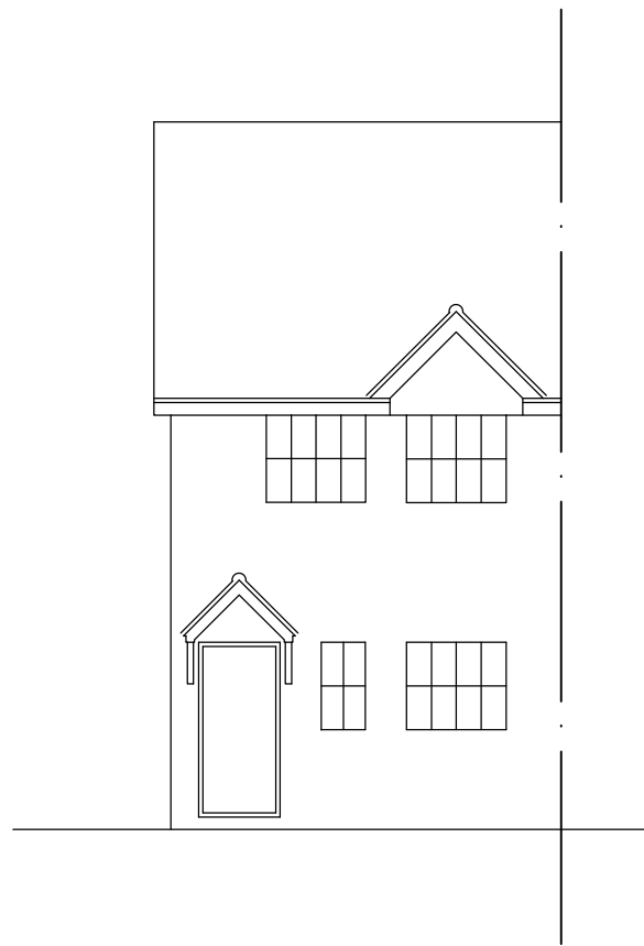
FRONT ELEVATION S - as existing